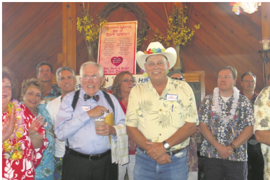
Some of the celebrity wait staff at the 1st annual luau.

The community is very excited about the facility—FISH already has volunteers lining up at the door!