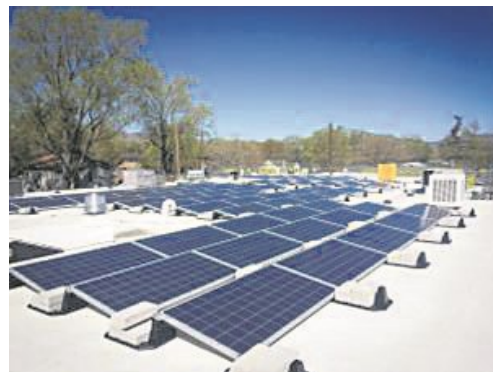
The solar panels on top of FISH's thrift store in Carson City.

FISH would like to extend a huge thank you to Black Rock Solar and NV Energy for their contribution and installation of solar panels on the roof of FISH's building in Carson City. Black Rock Solar is a Reno-based nonprofit that provides solar panels for other nonprofit organizations for free or at low cost. In November 2013 and May 2014, Black Rock Solar installed solar panels that convert sunlight into electricity to power the thrift store and the family dining room. NV Energy generously funded the project. While they do not cover all of FISH's power needs, the solar panels have saved a total of $8,000 on utilities this year alone. The savings allow FISH to provide even more of the food, shelter and services that touch so many lives in this community.