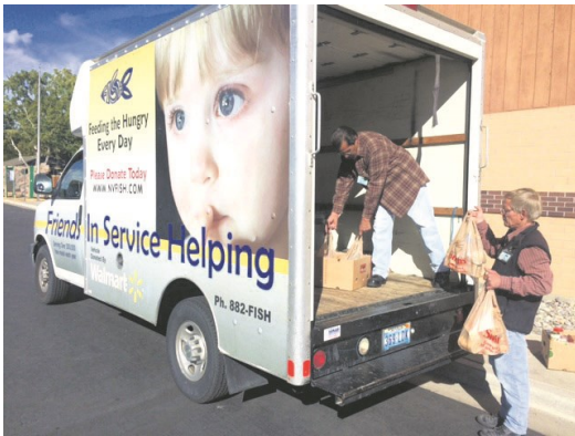
FISH staff collect donations from the Trick or Treat food drive.

It's that time of year again: time for our 15 th annual "Trick or Treat for FISH" fall school food drive. FISH along with the local schools in Carson City will be conducting a food drive contest for students to collect non-perishable food to replenish the inventory at the FISH food bank. Our food bank shelves are nearly empty and the school drive can make an enormous difference as we head in to the holiday season. This is an excellent opportunity for students in Carson to learn about the needs in our community and have the enriching experience of knowing they can make a difference. The food drive is also a