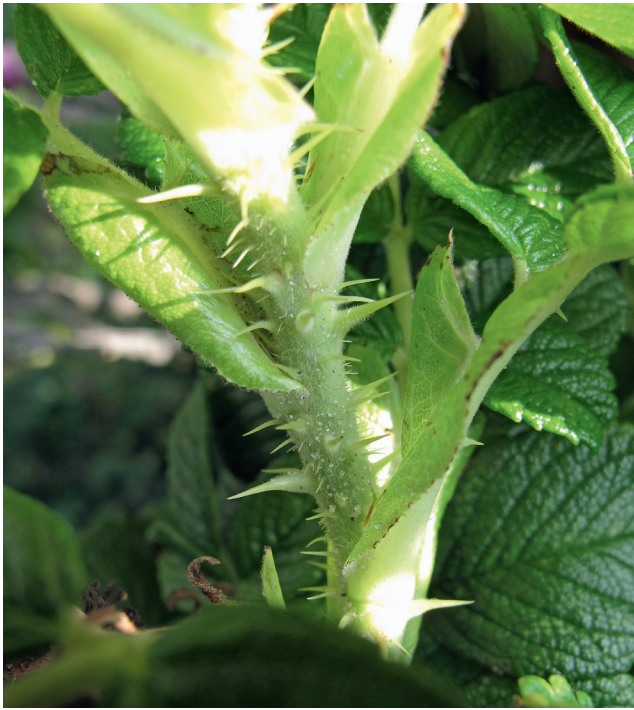
Figure 3 Stem with various types of spines.