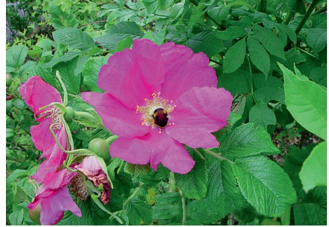
Figure 8 Attractive flowers and young fruits.

The potential level of social impact in the Netherlands is moderate.