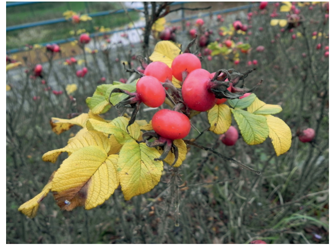
Figure 6 Hips in autumn.