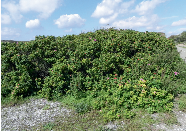
Figure 7 Infestation in the dunes in the Netherlands.

Rosa rugosa is used in breeding other cultivars of roses, viz. as rootstock.