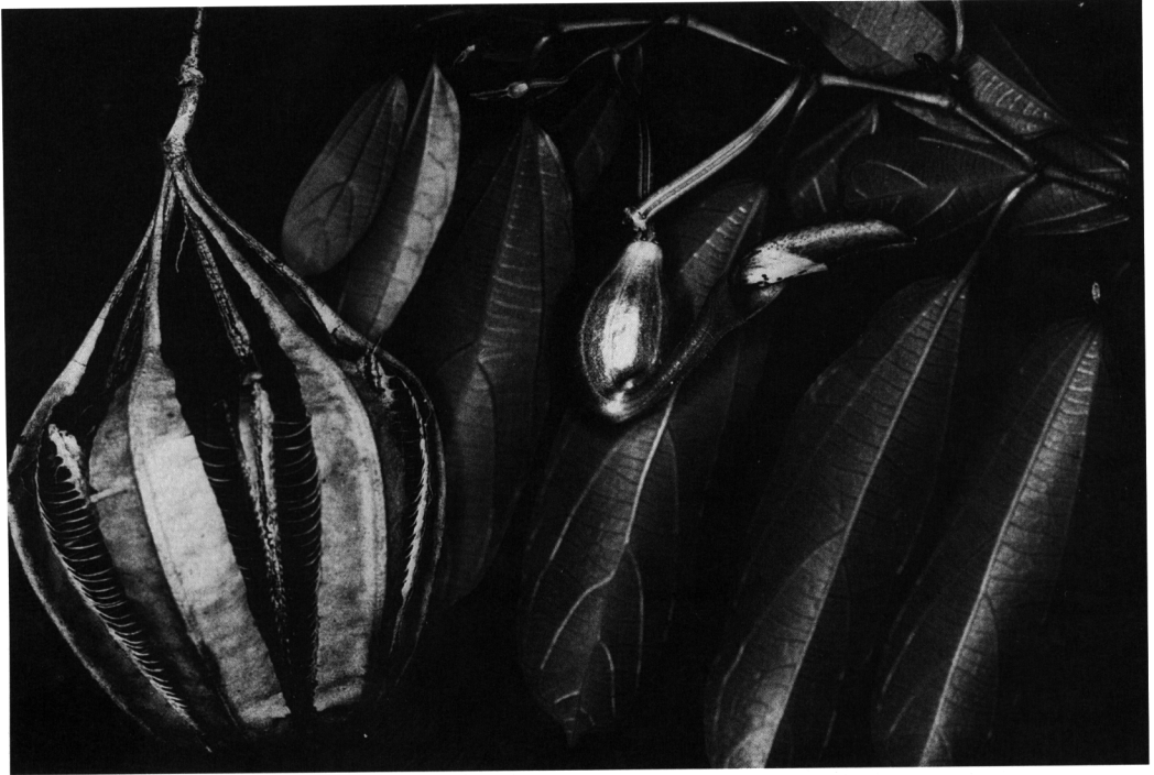
FIG. 1. Aristolochia dalyi (Daly et al. 8640).

or Peru, has been published. Some local floras have covered the family (Ahumada, 1975; Capellari, 1996), and a meager number of new species have been described (Ahumada, 1977, 1979, 1989). The Peruvian species were treated to some extent by Macbride (1937), largely on the basis of contributions by Schmidt (l.c.).