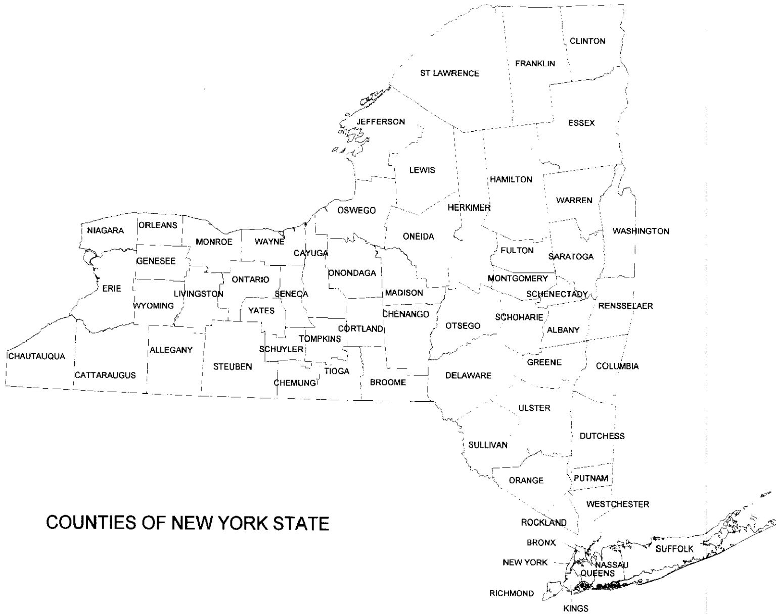
COUNTIES OF NEW YORK STATE