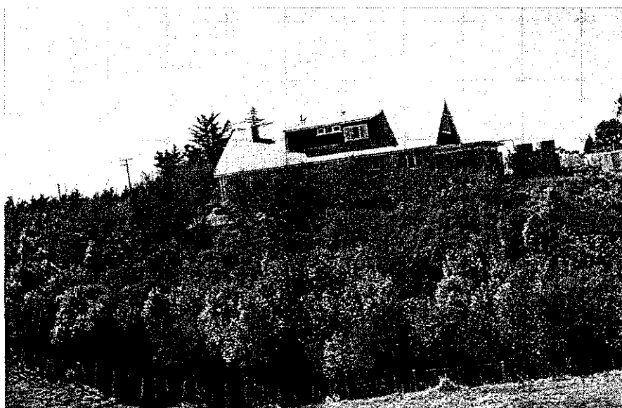
Figure 2: View of the planting taken in April 1962. Grass has largely been replaced by planted tree lucernes, and fast growing indigenous trees, particularly lacebarks, but much gorse is still present.

Lack of shelter and strong grass growth were the main problems initially, and some plants were cut back by frost - even totara slightly in their first year - and some suffered from lack of moisture. However maximum use was made of the increasing shelter provided by the gorse, together with tree lucerne ( Chamaecytisus palmensis ) and several faster growing indigenous species such as wineberry ( Aristotelia serrata ), lacebark ( Hoheria sexstylosa ) and Pittosporum spp. planted in open patches among the gorse. With the growth of these trees shelter improved greatly, and the small amount of summer watering was discontinued. By about 1962 it was possible to plant fruits of karaka ( Corynocarpus laevigatus ) and tawa ( Beilschmiedia tawa ) directly into places where the grass had been shaded out, and by 1966 frost-tender species such as puriri ( Vitex lucens ) were able to survive