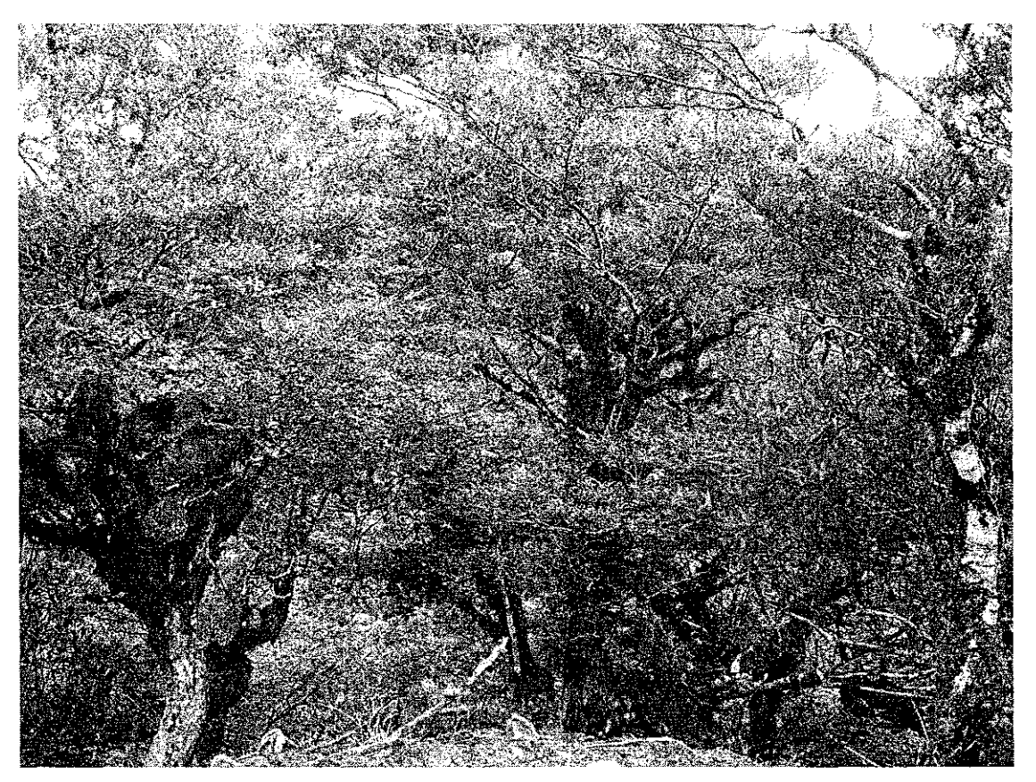
Figure 1: Nothofagus menziesii on Maungatautari

Silver beech ( Nothofagus menziesii ) has long been considered confined to the eastern side of the Waikato region and absent from the isolated volcanic cones of the Waikato (Clayton-Greene 1978; Wardle 1984, Clarkson 2002). However, while exploring the high points of Maungatautari in 2005, one of us (PB) came across a stand of silver beech (Fig. 1) on a rocky ridge (map ref. NZMS 260 T15 371491). On March 31<sup>st</sup> 2006, we revisited this site to confirm this discovery, to describe the silver beech population, and to search for any additional species not recorded before at Maungatautari that might be associated with the silver beech.