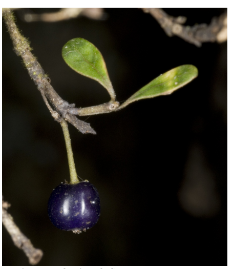
pedicellata from the Kaihu Valley,

The habitat is typical of this species in other parts of its range; Twig and fruit of Coprosma namely tall, wet kahikatea-dominated forest on a periodicallyflooded river margin/floodplain. Although cattle currently Northland.