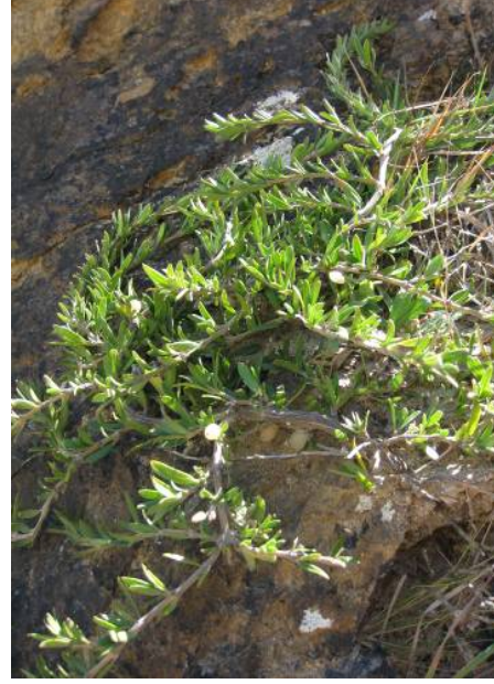
Coprosma acerosa hybrid (possibly acerosa x repens)

We cut across the paddocks to the Estuary observing a patch of Lilaeopsis novae-zelandiae ("tape measure" plant on account of the distinctive horizontal banding on the leaf parts) in one of the dry ditches. We then had a very interesting time. Wayne and Kathi showed us the trials that they are doing on the Paspalum vaginatum (saltwater paspalum) to discover what will be the best way to control this as it is spreading across the flats. Where the two channels meet, a very low bank has built up from wind action on the sand and with the cover of the paspalum, has altered the flow of the main channel showing what can happen in a relatively short space of time. Two weeks prior to our visit, the spartina had been sprayed again. This has