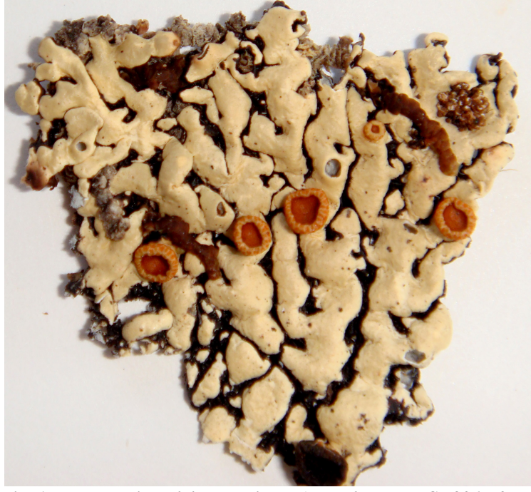
beech forest endemic (see Galloway Fig. 1. Meneguzau putchau speciments), Southern G.M. Crowcroft, CHR), Rekohu (Chatham Island), Southern Tablelands, Rangaika Scenic Reserve.

Here we report on the recognition of Menegazzia pulchra (Parmeliaceae) from Rekohu (Chatham Hitherto this uncommon species was known only from a rather restricted area of beech (Nothofagus) forest in the Waimakariri River and nearby catchments apparently centered on the Craigieburn Range, Canterbury (Galloway 1983, 1985, Galloway 2007). As its specific epithet implies, Menegazzia pulchra is an attractive species easily distinguished from the 19 other named species accepted in the New Zealand lichen mycobiota (Galloway 2007) by the apothecia which have distinctive bright orangered margins. To date it has only ever been found in association with mountain beech (Nothofagus cliffortioides) forest and has perhaps come to be viewed as an obligate Fig. 1. Menegazzia pulchra specimen (P. J. de Lange CH2364 &