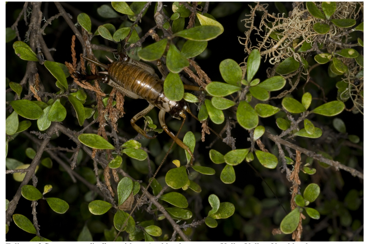
Foliage of Coprosma pedicellata with an Auckland tree weta, Kaihu Valley, Northland

This site is interesting as it is currently the only known one where C. pedicellata and C. parviflora occur sympatrically. These two species are superficially similar but are distinguished in detail by Molloy et al. (1999). Notably C. parviflora has thick, yellow-green to dark green leaves; a stout, planar branching architecture; sessile pink-purple fruit (although not fruiting at Dargaville when visited); orange inner bark on stems > 2 cm diameter (Molloy et al. 1999); and it occurs on forest margins, and along swamp margins but not in standing water (Molloy et al. 1999; Jane 2005). Conversely C. pedicellata at Dargaville had relatively thin, shiny, dark green leaves (Photo 1); an upright, virgate branching habit; dark purple fruit on 4 mm-long pedicels (Photo 2); yellow inner bark; and was in the understorey in standing water, rather than on the forest margin.