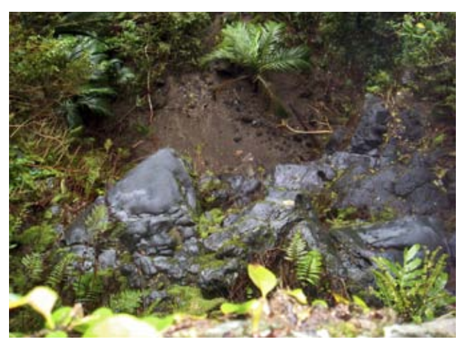
Fig. 11. Looking down the 50 m "waterfall" that presents a formidable barrier that has to be climbed or descended when using the Sunshine Valley Track. Despite the heavy rain experienced during our time on Raoul Island, the waterfall and indeed the entire Sunshine Valley ravine system was fairly dry. In hindsight, this was probably a good thing as the state of the ravine and the vegetation clothing its walls indicates that it is prone to sudden, extreme, flash flooding. The dominant ferns clothing the waterfall cliff face are the Raoul Island form of kiokio ( Blechnum novaezelandiae ) and Nephrolepis flexuosa .