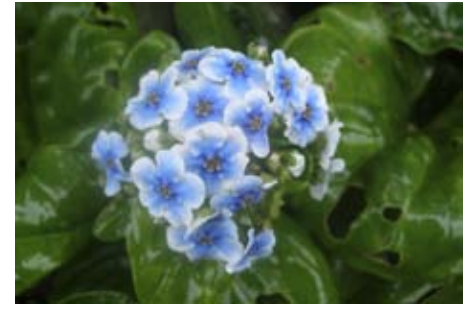
Chatham Island forget-me-not ( Myosotidium hortensium) is the most searched for species on the NZPCN website: <a href="www.nzpcn.org.nz/flora_details.asp?ID=73">www.nzpcn.org.nz/flora_details.asp?ID=73</a>.

All of these species are viewed at least once daily, with the top four species being viewed up to four times daily. If anyone knows why Chenopodium detestans is such a sought after species, we look forward to hearing from you. The Network website was launched in August 2003 at the inaugural conference of the New Zealand Plant Conservation Network in Wellington. The site was initially funded by TFBIS (the government's Terrestrial and Freshwater Biodiversity Information System Programme), which works to increase awareness of and access to fundamental data and information about terrestrial and freshwater biota and biodiversity.