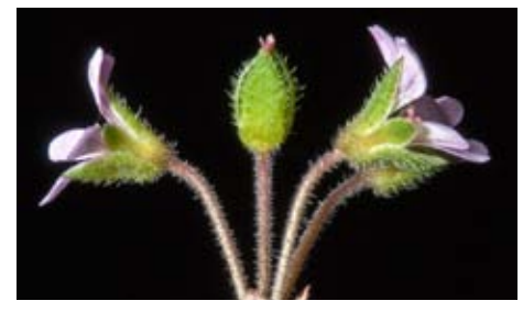
(left) Aciphylla aurea. <a href="www.nzpcn.org.nz/flora">www.nzpcn.org.nz/flora</a> details.asp?ID=1451. (centre, top) Hectorella caespitosa. <a href="www.nzpcn.org.nz/flora">www.nzpcn.org.nz/flora</a> details.asp?ID=804. (centre, bottom) Dracophyllum ophioliticum. <a href="www.nzpcn.org.nz/flora">www.nzpcn.org.nz/flora</a> details.asp?ID=3805. (right, bottom) Pelargonium inodorum. <a href="www.nzpcn.org.nz/flora">www.nzpcn.org.nz/flora</a> details.asp?ID=2215.