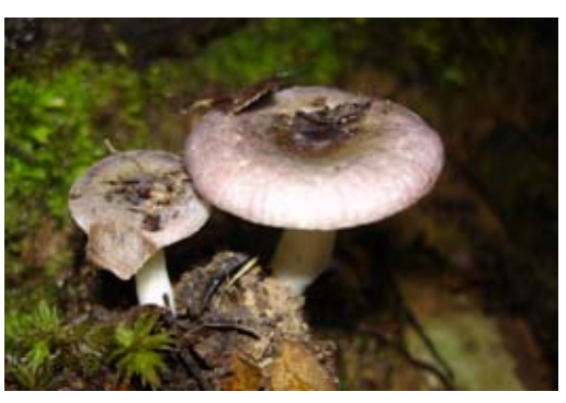
A pale blue form of Entoloma hochstetteri (far left) and delicate pink Russula roseopileata are found at Holdsworth in Tararua Forest Park.