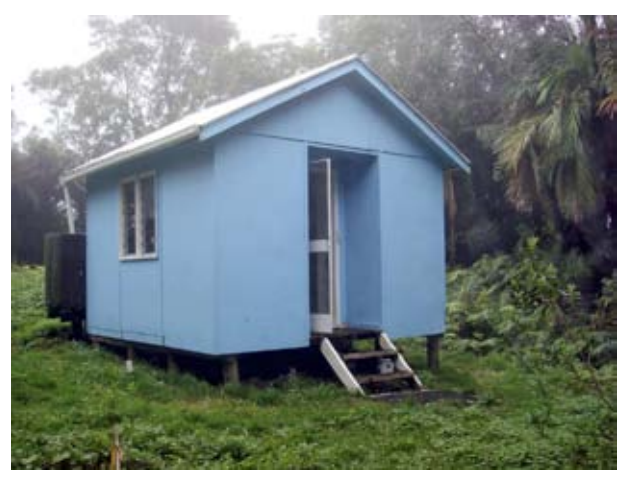
Fig. 7. Mahoe Hut seen here in the evening mist. This, despite its rotting piles, is one of the nicer huts on Raoul Island. The clearing around the hut has been planted with Kermadec Koromiko ( Hebe breviracemosa ) (one can be seen in this image toward the bottom right hand side) which has done exceptionally well ("too well" opined one person in the Hut log) and, in the rank growth, grew Haloragis erecta subsp. erecta , common in New Zealand but scarce on the Kermadecs.