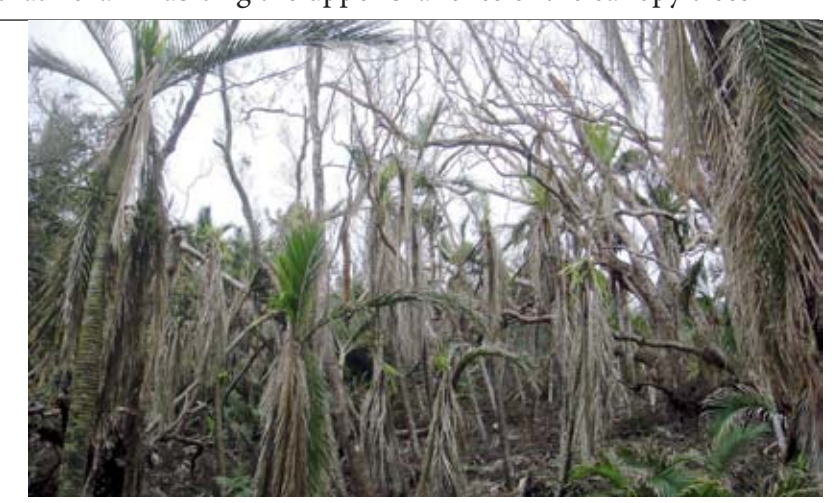
Fig. 2. Cyclone damaged forest above roadside leading from Boat Cove to Moumoukai Track, Raoul Island. The ground cover here has been stripped bare of most vegetation, nevertheless, in these areas at the time of our visit two months after the cyclone struck, thousands of Kermadec poplar ( Homalanthus polyandrus ) seedlings 5–15 mm tall were emerging from the exposed soil.