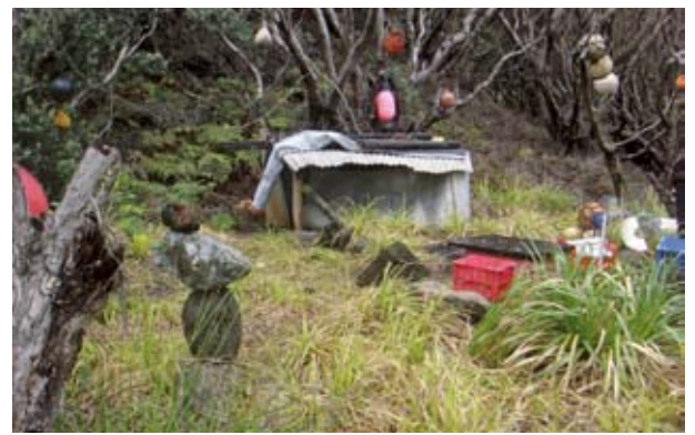
Fig. 13. Sunshine Bivy, bottom of Sunshine Valley, Raoul Island. The bivy surroundings at the time of our visit were festooned with an assortment of "art" made by the "Raoulies" from rocks and piles of plastic flotsam (mostly buoys) washed up on the nearby Sunshine Coastline. The bivy was described in the Mahoe Hut log as "wonderful until night fall when the local brine mosquitoes make their presence felt rather too much". The surrounding vegetation is dominated by Kermadec pohutukawa (Metrosideros kermadecensis). On the slope behind the bivy can just be seen Pteris comans (a common ground fern on Raoul Island), while the foreground vegetation is dominated by Carex kermadecensis with some Cyperus insularis, Ficinia nodosa and seedling Kermadec ngaio (Myoporum rapense subsp. kermadecense).

Once on the Sunshine Coastline, Warren and I began the long rock hop back to Boat Cove. As the tide was out, I spent some time profitably fossicking about in rock pools for invertebrates and seaweed. A particularly beautiful red seaweed with iridescent blue apices, Martensia fragilis, caught my eye because it was quite common in some rock pools. The rock pools also sported some fine corals, an assortment of highly coloured fish and one fairly big (0.8 m long estimated) spotted grouper (Ehinephelus daemelii). After several hours, we reached an impassable bluff, which had not been mentioned in the Mahoe Hut log account of this part of the coastline. This bluff was a major headache to traverse due to yet more cyclone-damaged forest. We figured, therefore, that there had to be a track bypassing it somewhere but we simply could not find it. Indeed, it was only after some rather tricky rock climbing over a series of unstable razorbacks, tree falls and sections of cliff faces that I would rather have done without that we found at the top (curses) a track! It transpired that we had missed the base of this track ("The Ringbuster" as it is