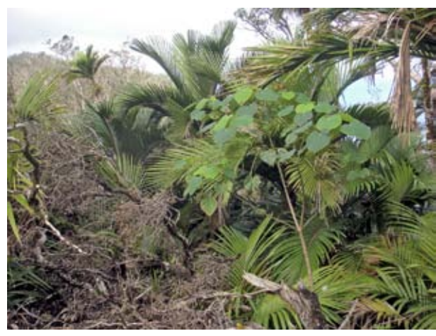
Fig. 6. Cyclone damage on the track from Moumoukai to Prospect, Raoul Island, showing toppled Kermadec pohutukawa ( Metrosideros kermadecensis ), fallen through intact nikau ( Rhopalostylis baueri ) and Kermadec poplar ( Homalanthus polyandrus ).

The cyclone damage on the track from Moumoukai to Prospect (Fig. 6), though not as bad as the Boat Cove Road, was sufficiently bad that the track was still buried in places by fallen trees. I soon lost Warren, Mike and Swanee as I was taking the time to critically investigate each tree fall for bryophytes and lichens. At some point on this traverse, the weather turned foul and I was again bathed in thick fog and doused with rain. Near Prospect, I was impressed with a dense stand of the largest Cyathea milnei I had yet seen on Raoul Island, and on the trunks of these I found plenty of Calomnion complanatum, a moss I had seen very little of during the May 2009 trip. Associated with the moss was plenty of Tmesipteris lanceolata , itself not especially common on Raoul and lots of Hymenophyllum