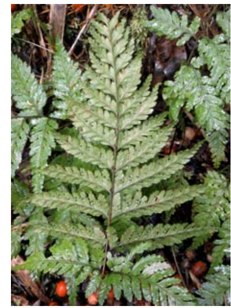
Fig. 3. Lastreopsis "Kermadec" an as yet undescribed Raoul Island endemic fern.