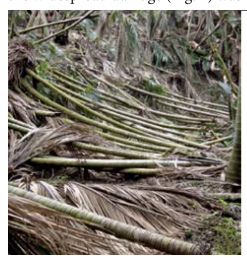
Fig. 1. Boat Cove Road, Raoul Island – this portion of road was relatively easy to traverse being buried under a toppled stand of nikau ( Rhopalostylis baueri ).

Boat Cove Hut, somehow, had remained—miraculously—untouched by tree falls but the road, which I had intended to use as a quick access route to the Moumoukai Track (Moumoukai at 518 m a.s.l. is the highest point on Raoul Island) was not so much gone as completely buried in tree falls (Fig. 1). Thus a route that normally would take a person of average fitness 35 minutes or so to traverse took Warren and me 4½ hours of crawling under, climbing over or chopping through a myriad of fallen Kermadec pohutukawa, nikau ( Rhopalostylis baueri ), mapou ( Myrsine cheesemanii ), mahoe ( Melicytus aff. ramiflorus ), and tree ferns ( Cyathea kermadecensis and C. milnei ). I have experienced cyclone-generated tree falls in Nothofagus forest in the Raukumara Range, East Cape, North Island, that was "difficult" but that was nothing by comparison. The only positive thing about the widespread damage (Fig. 2) was that flora inhabiting the upper branches of the canopy trees