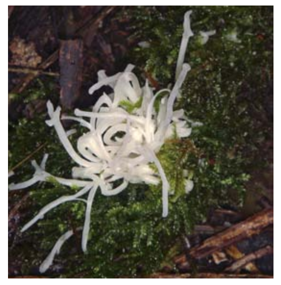
Fig. 9. What is probably Clavulina cristata var. zealandica (P. Johnston, pers. comm.) growing on rotting nikau ( Rhopalostylis baueri ) frond that is mostly covered in the moss Eurhynchium speciosum .

At the base of the first tier of cliffs, on the ravine floor, I was surprised to see that, despite the heavy rainfall of the previous night, and indeed most of the last week, the ravine was dry (though bearing much evidence of flash flooding). Progress along the ravine was reasonable, despite the numerous cyclone-felled trees and log jams. In places, the dominant shrub/tree fringing the ravine was Kermadec nettle tree. Kermadec poplar, tutu and mahoe were also common. The rock, mostly a coarse andesite interbedded with an apparently pyroclastic dacitic material, was mostly devoid of vegetation though, in places, especially where seepages emptied out into the ravine, dark green curtains of Radula cordiloba subsp. erigens and another Raoul Island endemic liverwort Plagiochila pacifica were common. In one of these "curtains" I discovered a small amount of Cyclodictyon blumeanum, another tropical moss that also grows on the northern side of Raoul at Western Spring, Eastern Spring and up Ravine 8. This species is listed as "Nationally Critical" (Glenny et al. 2011) on account of the overall small population size on Raoul, its only known location in the New Zealand Botanical Region. Further down the ravine system, we found a small area of apparently natural Kermadec koromiko, and in one place on a small eyot, growing above the flood line on an exposed root plate of a mahoe tree I found another patch of Crytopogonium.