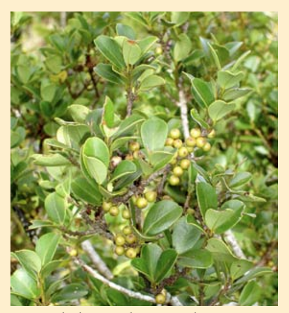
Myrsine chathamica.

Plant of the month for October is Myrsine chathamica. This handsome tree, the Chatham Island matipo, grows to about 12 m tall. It is usually multi-stemmed, often with many suckers and epicormic stems arising from the trunks when growing in exposed conditions. It occurs naturally on the Chatham Islands and further south on Stewart Island and other small islands in Foveaux Strait. It's abundant on the Chatham Islands where it's an important part of the forest canopy, although less so where soils are sandier. Myrsine chathamica is fairly distinct from other New Zealand Myrsine spp. Leaves are flat with entire margins, glossy dark green to green, lighter underneath, often with hairs on the midrib and a shallow notch at the leaf apex. Attractive violet-purple fruit appear from July to