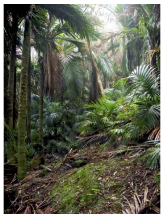
Fig. 8. Moderately intact nikau ( Rhopalostylis baueri ) forest at the start of Sunshine Valley track.

Our radio sked at 6.30 am the next morning (16 May) advised us that we were to be picked up at Boat Cove at 1.00 pm. Our intention, therefore, was to head down the Sunshine Valley, exploring the ravine system as we went, then rock hop the Sunshine coastline back to Boat Cove. We were pleased to see that the hut log advised this was easy going... ("Yeah Right"). The weather had also cleared somewhat, making for an enjoyable walk free of the body drenching mist and rain and allowing some fine views of the spectacular cliff and ravine network that makes up the Sunshine catchment. Initially, we walked through a reasonably intact nikau forest (Fig. 8), the forest floor sporting some interesting fungal growths (Fig. 9) that, for lack of the necessary equipment, I could only admire and photograph (a critical investigation of the mycophytes of Raoul is sorely needed). However, all too soon, the track started its precipitous descent into the upper ravine of Sunshine Valley (Fig. 10).