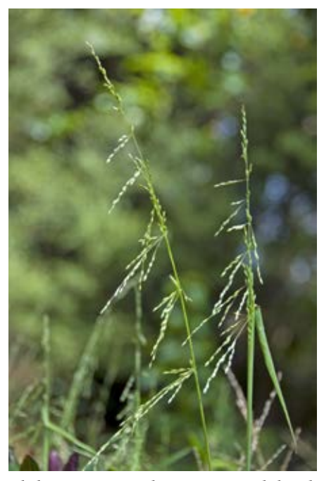
Ehrharta erecta —distinctive seed head.

Polling commences soon, so make your choice of something worthy of recognition and damnation. Voting only takes five