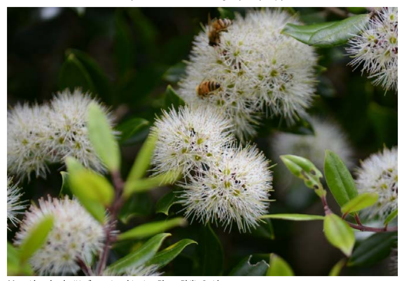
Metrosideros bartlettii in flower, in cultivation.

"This is a beautiful tree and sadly one that could well be on the brink in the wild but it didn't have to be like this. I remember the forest at Unuwhao when there were around 30 trees but there are so few now due to the ravages of our furry friends."