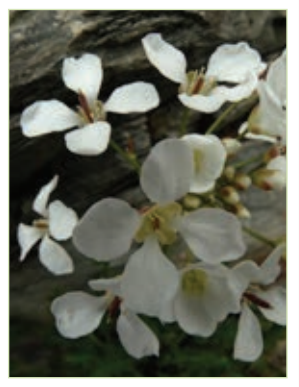
Pachycladon wallii.