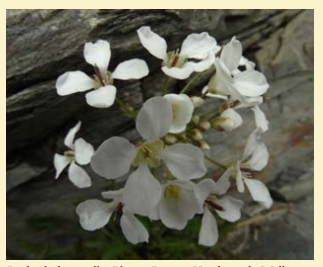
Pachycladon wallii.

The plant of the month for October is Pachycladon wallii , one of 10 Pachycladon species endemic to New Zealand. The species is adapted to harsh habitats in the mid to high alpine zone. It is found on shaded overhanging bluffs and rock ledges, generally out of the reach of browsing animals. It has a restricted distribution, being found only in the higher alpine areas of southern Central Otago and the Eyre, Garvie, and Umbrella Mountains in northern Southland. The plants form bright, lush basal clumps, with taller unbranched flowering stems well overtopping the rest of the plant. The species is similar in appearance