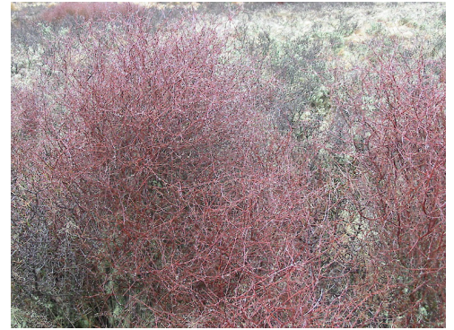
Upper Manuherikia Valley.