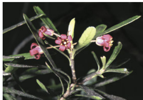
Pittosporum patulum .

This is a species of subalpine scrub, and canopy gaps in mountain beech forest. It often occurs in sites that have undergone disturbance (e.g., avalanche chutes, fire induced scrub, and river margins), although it is not always required for regeneration. Strongholds of adults occur in subalpine scrub that are recruiting without disturbance, and bluffs in beech forest are similarly little-disturbed.