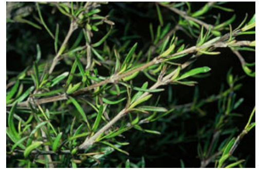
Coprosma intertexta at Danseys Pass.

Dioecious, erect, somewhat fastigiate, extensively to sparingly branched, suckering shrub forming thickets up to 2 x 2 m. branches and branchlets fastigiate, filiraculate divaricate; branchlets at first finely puberulent becoming glabrous with age; bark initially pale-grey maturing dark brown. Leaves on short brachyblasts or in opposite pairs or near sessile fascicles. Interpetiolar stipules shortly-sheathing, broadly oblong triangular, obtuse with an attenuated apex surmounted by a single, deciduous apical denticle, denticles otherwise 3-6 all deciduous, outer surfaces finely ciliolate, undersides sparingly so, stipular collar-margins chartaceous when dry. Petioles slender 0.5-2 mm long. Leaves 7- 15 x 1-2 mm, darg grey-green to red-brown or purple-green, narrow-oblong to narrowly obovate-oblong, often slightly falcate, subacute, apiculate, margins initially puberulent, reddish; midrib and sometimes secondary veins evident.