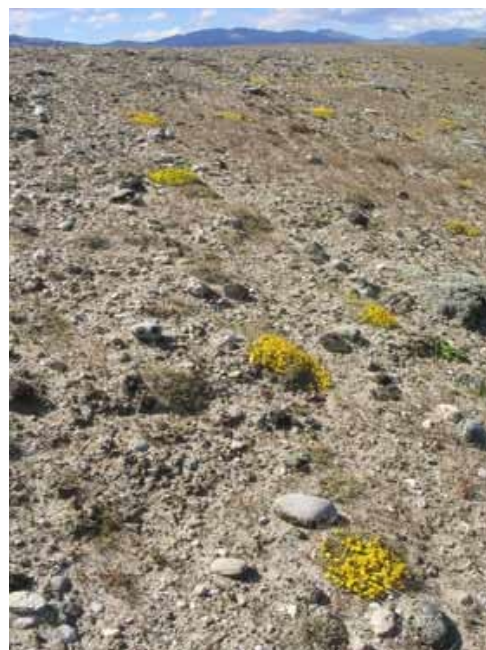
Mounds of flowering plants, Pisa Flats.