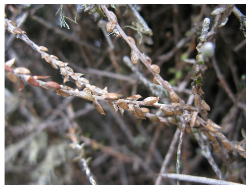
Cave Stream.