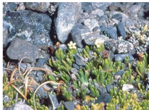
Bealey River (January).