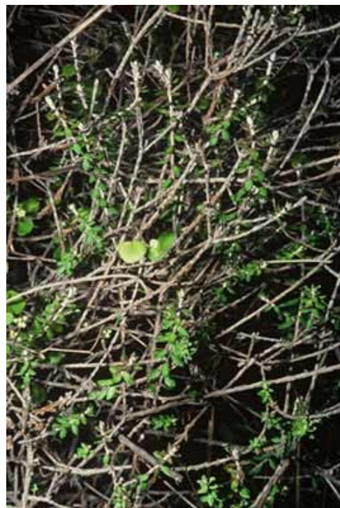
At Poulter Bridge (November).

A species of lowland to montane situations. Usually found on river terraces and alongside river gorges. Always in grey scrub, where it is primarily associated with matagouri ( Discaria toumatou Raoul) shrubs.