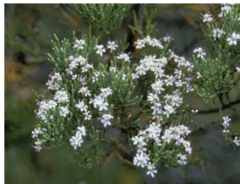
Flowering branch of Leonohebe cupressioides .