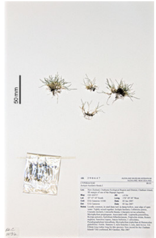
Herbarium specimen: AK 298647.