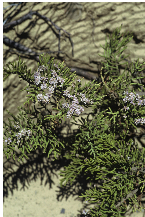
Enys Scientific Reserve, in netted enclosure, December 1994.

Apparently confined to bog pine ( Halocarpus bidwillii ) dominated vegetation growing on river terraces, along tarn margins and on small islands within tarns. Seems to require seasonally high water tables, or at least habitats with moderately high levels of available moisture.