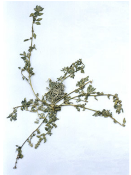
Close up of plant.

Open or sparsely-vegetated ground such as clay and salt plans, dried out river and lake beds.