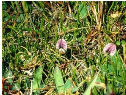
Waimakariri river, January.

Inhabiting stable but unconsolidated, sparsely vegetated river bed gravels, outwash fans, terraces, and stony ground.