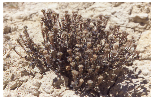
Close up, Lepidium solandri , Springvale, Central Otago.