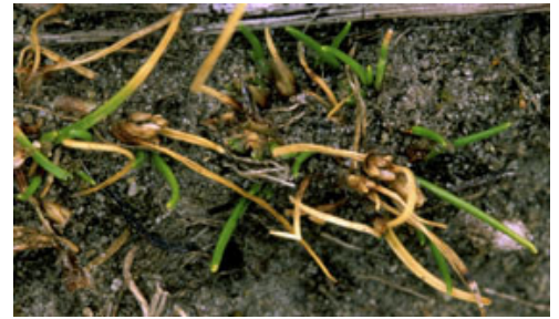
Close up of plants.

Minute, moss-like, densely tufted plant forming circular patches 10–100 mm diameter and up to 60 mm tall, bright green above, reddish brown below. Rhizome < 1 mm. diameter, much branched; sheathing bract at each node loose, membranous, with red nerves. Culms < 1.5 rarely up to 30 mm long, < 0.5 mm diameter. Leaves 1–2 on each branch, much > culms, 5–60 mm long, < 0.5 mm wide, setaceous, plano-convex; sheath membranous, red-nerved. Inflorescence an apparently lateral, single spikelet, or rarely 2, hidden among the leaves, pale green, occasionally with red markings; subtending bract leaf-like, channelled, very much > culm from which it arises and almost = leaves. Spikelets 2.5–3.5 x 1.5–2.0 mm, elliptical or oblong. Glumes 1–2 mm. long, ovate, elliptical, obtuse, white and membranous, or with patches of red on the sides; keel thick, green, occasionally slightly excurrent. Hypogynous bristles 0. Stamens 2–3. Style-branches 2–3. Nut c.0.5 x 0.5 mm, c. 2/3 length of glume, obovoid to suborbicular, plano-convex, dorsally rounded, noticeably apiculate, red-brown to dark brown, almost black, surface often shining but distinctly reticulate.