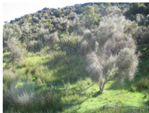
Shrubland, Millers Flat.