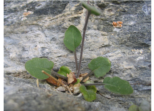
Pachycladon cheesemanii, Old Woman Range.