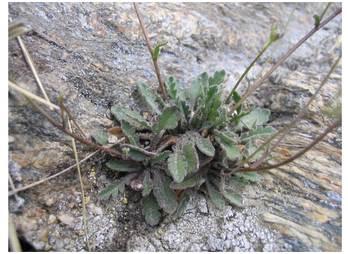
Pachycladon cheesemanii , Hector Mountains.

Lowland to subalpine tussock grassland, grey scrub, boulderfalls, talus, stable scree, rock overhangs and cliff faces. Now virtually confined to inaccessible habitats such as cliff faces, rock overhangs and amongst dense grey scrub.