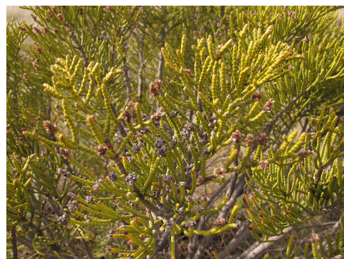
Enys Scientific Reserve, Castle Hills.