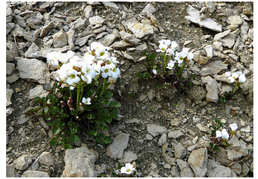
Castle hill basin, Canterbury.

A plant inhabiting fine-grained limestone scree, stony colluvium, and also growing on the margins of associated sparsely vegetated, stable to semi-stable limestone rock outcrops and bluffs.