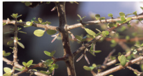
In cultivation, Stokes Valley. Oct 2003.