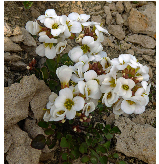
Castle hill basin, Canterbury.