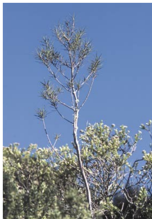
Pittosporum patulum .