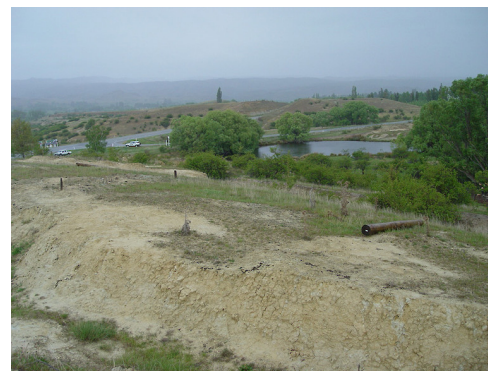
Lepidium solandri . Photographer: John Barkla

Short and tall tussock grassland, bare hillsides, salt pans, grey scrub and other poorly vegetated ground. On open clay or salt pans, limestone talus, gravel veneers overlying schist, mudstone, or eroded silts and clays.