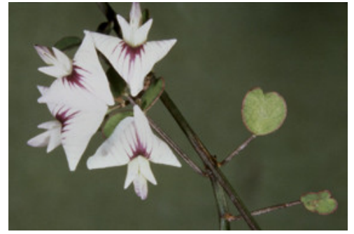
Carmichaelia kirkii .

A plant of moderate to high fertility sites. Usually associated with grey scrub communities particularly those along riverbanks and gorges, or on poorly drained river terraces. It is often associated with totara ( Podocarpus totara var. totara ) forest, and has also been found in carex dominated wetlands, or within kahikatea ( Dacrycarpus dacrydioides ) dominated forest.