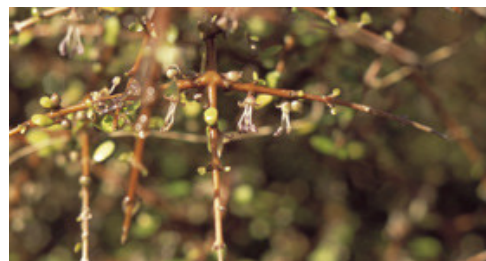
In cultivation, Stokes Valley. Oct 2003.

Occupies a range of habitats from seasonally flooded, alluvial forest prone to very cold winters and dry summers, to riparian forest and subalpine scrub, or as a component of grey scrub or mixed Podocarp forest developed on steeply sloping basaltic or andesitic rock. The key feature of the majority of C. wallii habitat is that the substrates are rather fertile and the vegetation is limited by frost, water logging, or severe summer drought. Never associated with broad-leaved canopy trees.