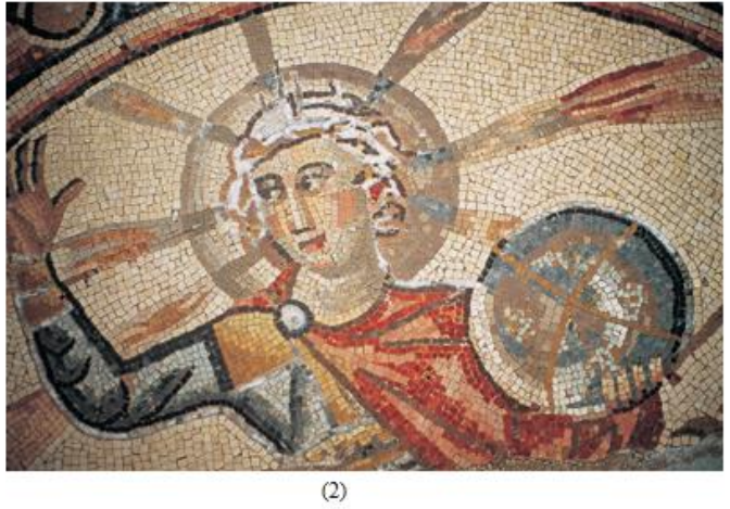
Figure 5. Hammat Tiberias Synagogue, polychrome mosaic, 4<sup>th</sup> century CE. (1) Overview of Hammat Tiberias mosaic floor. (2) Detail of Sol from the Hammat Tiberias mosaic.

The center panel depicting Sol and the zodiac is the earliest representation of this type. Sol is represented in the typical fashion, wearing a crown of rays on his head with one hand raised in a gesture of power while the other holds a globe. While the preservation of the Tiberias mosaic is not complete, it seems reasonable to assume that he stood in his quadriga. Surrounding