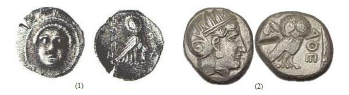
Figure 1. Yehud Coins 4<sup>th</sup> Century BCE: (1) front facing head; owl with inscription "Yehezqiah the governor". Retrieved February 26, 2015 from http://www.jewishvirtuallibrary.org/jsource/images/Ancient_coins/Smallsilvercoin.jpg (2) helmeted head of Athena; owl. Retrieved February 26, 2014from http://www.forumancientcoins.com/Coins2/66406p00.jpg