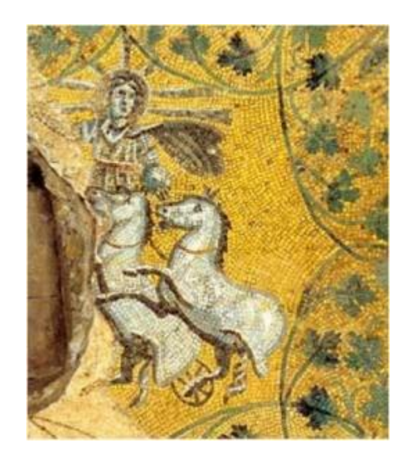
Figure 9. Tomb of the Julii Christ as Sol Invictus, polychrome mosaic, 3<sup>rd</sup> Century CE. Retrieved February 26, 2015 from http://studydroid.com/imageCards/0v/27/card-32579317-front.jpg

Yet another example of Christ depicted as Sol is found on the Sarcophagus from la Gayolle. This sarcophagus, found in southern France, also dates to the third century. The depiction of Sol Invictus is interpreted to represent Christ based on its concurrence with other commonly used Christian motifs on the sarcophagus. The relief shows a frontal bust of Sol, identified by his raiment and the rays that surround him, to the left and above a baptism scene (Huskinson, 1974, p.79). Though the identity of the figure said to represent Sol is debated amongst scholars, due to the similarity of attributes and the location of the figure situated above the baptism scene, it does not seem implausible that this should correctly be identified as Sol representing Christ.