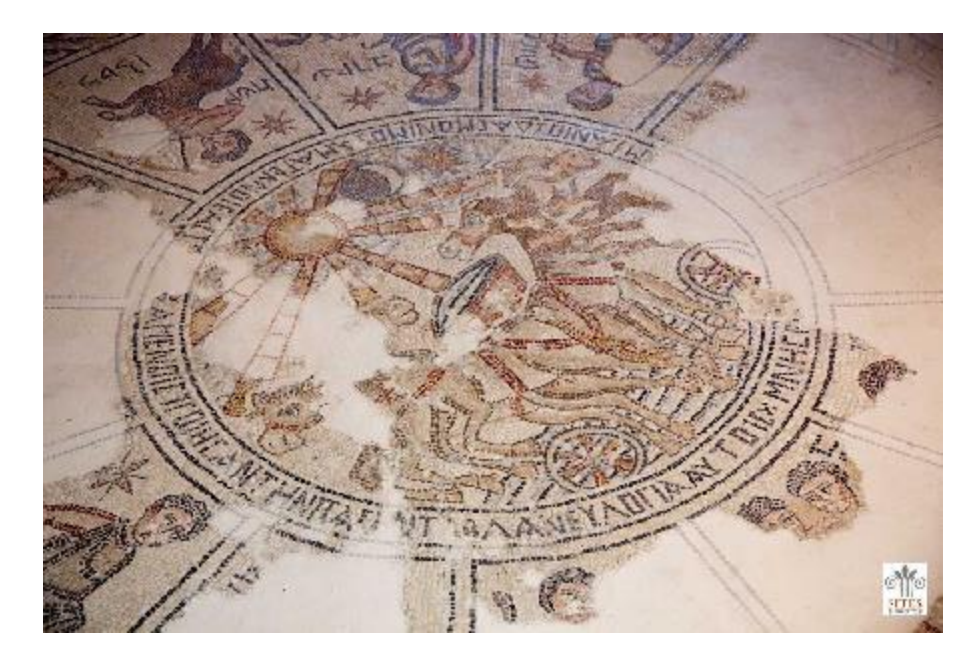
Figure 7. Detail of panel depicting Sol and the zodiac from Sepphoris, polychrome mosaic, 5<sup>th</sup> century CE.

The final synagogue to be examined is Bet Alpha. Located in the Jezreel Valley, the Bet Alpha synagogue was excavated in 1929 by Eleazar Sukenik on behalf of Hebrew University (Levine, 2012, p. 280). Unlike Tiberias and Sepphoris, next to nothing is known of Bet Alpha apart from the information provided by archaeological excavation. Taken together with numismatic evidence, the Greek inscription found near the entrance to the central nave dates the synagogue to the early sixth century (Levine, 2012, p. 281). Bet Alpha was constructed according to a typical Byzantine basilica plan, with a courtyard, narthex, and hall divided into a nave with two side aisles by two rows of pillars. Oriented north to south, the structure faced Jerusalem (Levine, 2012, p. 280). Like at Tiberias, the Bet Alpha mosaic floor is divided into three panels, which presented following the orientation of the building, are as follows: (1) a scene depicting the Binding of Isaac; (2) the zodiac cycle framing a depiction of Sol; and finally (3) a Torah shrine flanked by menorahs, shofars, and other Jewish symbols and ritual items. The artistic depictions are executed with far less skill than those of Tiberias and Sepphoris. The