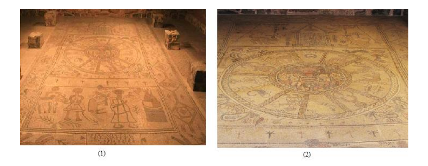
Figure 8. Bet Alpha Synagogue, polychrome mosaic floor, 6<sup>th</sup> century CE (1) Overview of Bet Alpha mosaic floor. (2) Detail of Sol and the zodiac from Bet Alpha mosaic.

figures are two-dimensional and static, presented frontally, with little attempt to represent realistic body proportions. Yet, while artistically naïve, the archaeological preservation is paramount (Figure 8-1).