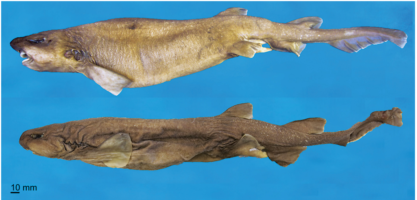
Figure 1. Bythaelurus naylori n. sp., holotype, adult male 452 mm TL (CAS 237869), unpreserved specimen (upper), and post-preservation (lower) lateral view.