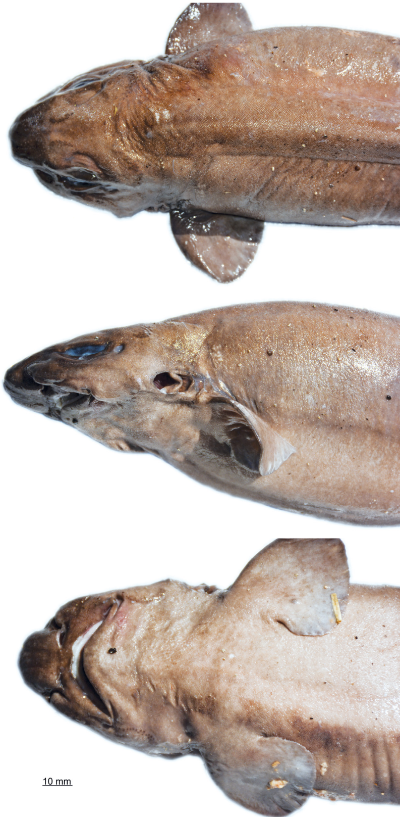
Figure 2 (below). Bythaelurus naylori n. sp., dorsal (top), lateral (middle), and ventral (bottom) views of head.