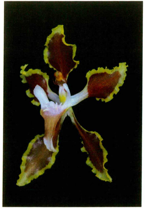
A: Cyrtochilum deburghgraeveanum

K: Odontoglossum crassidactylum