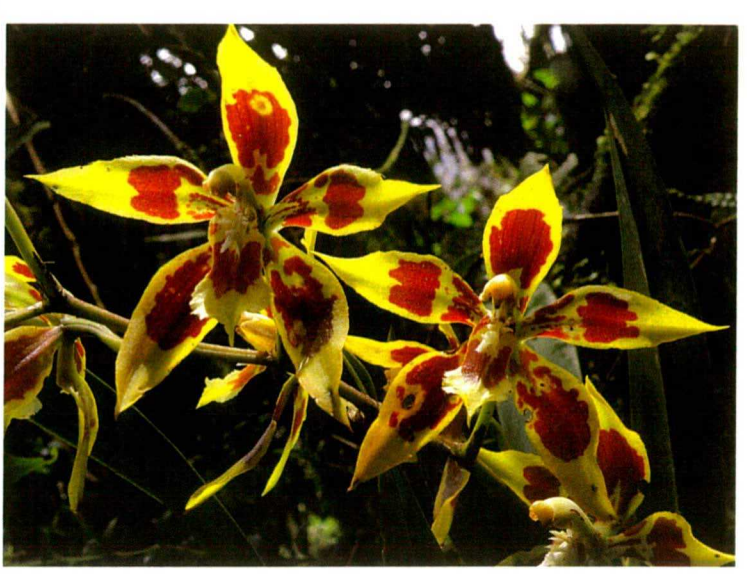
J:: Odontoglossum 'auroincarum'