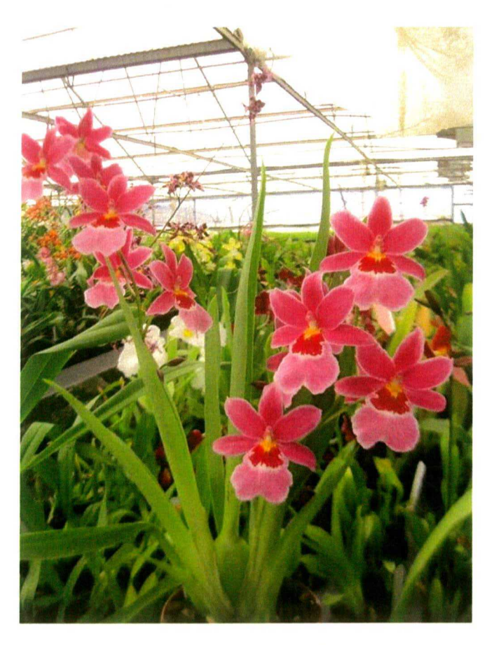
Odtna Lauris x Cda sanguinea 'NH'

of the future for judges who actually know anything about the genus!