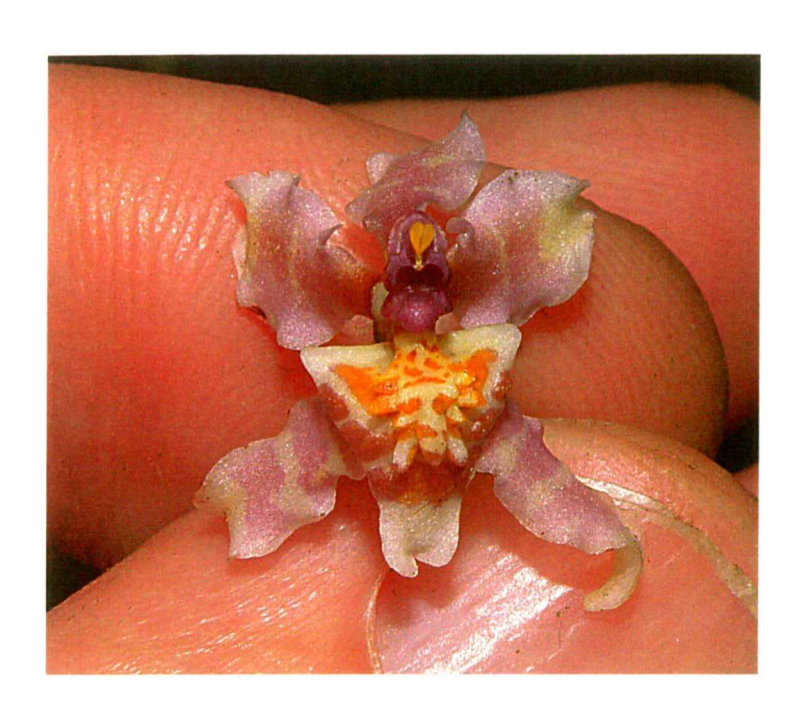
C: Cyrtochilum russellianum