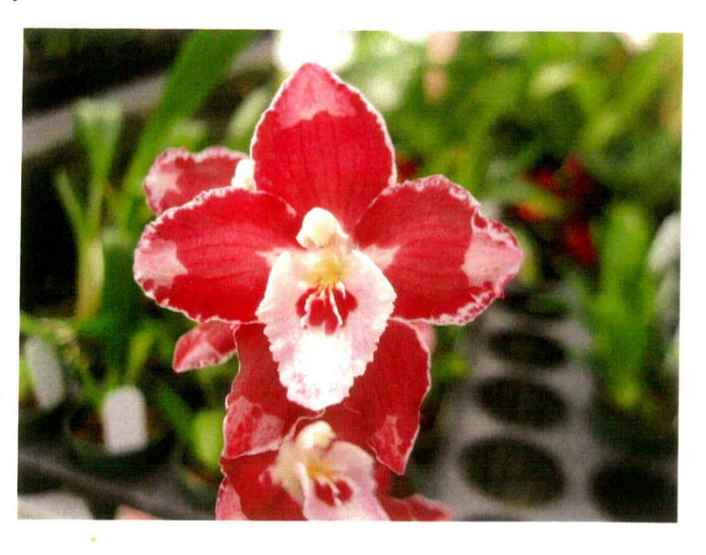
Odcdm Tribbles x Oda Prince Vultan #1

I was in Medellin recently and saw what I consider to be an exceptionally fine and large Mtps. vexellaria at Colomborguideas. It is encouraging to see plants of this quality still being collected from the wild and most importantly, propagated for future enthusiasts. I measured the flower across the lip and it was 10.1 cm in diameter, pretty much meeting the definition of huge. Yes, I made a couple of hybridizing attempts with this plant, it was only a small piece in a 4" pot so it should have a beautiful future.