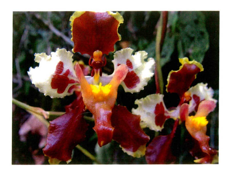
B: Cyrtochilum ruizii