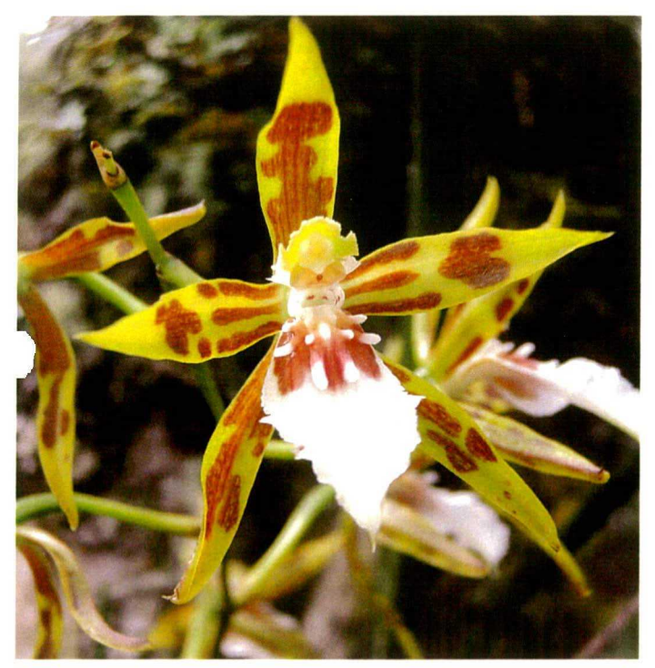
K: ODontoglossum crassidactylum'