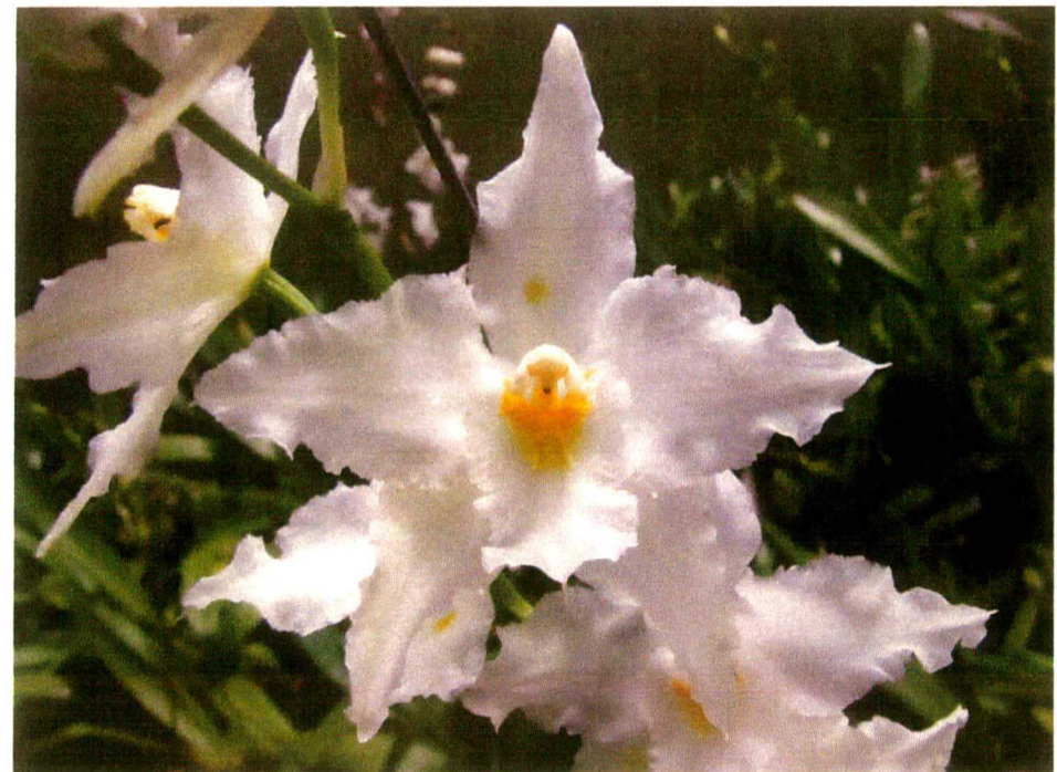
A xanthic Odm . Ardentissimum ( crispum x nobile )