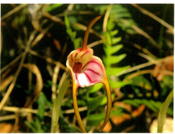
H1: Masdevallia 'comasensis'