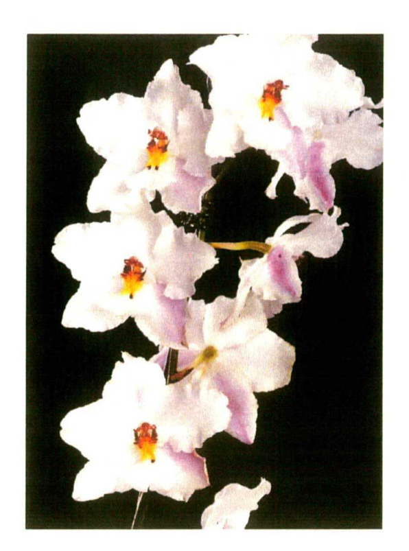
Cyrtochilum Juliann 'Colombo' HCC/AOS