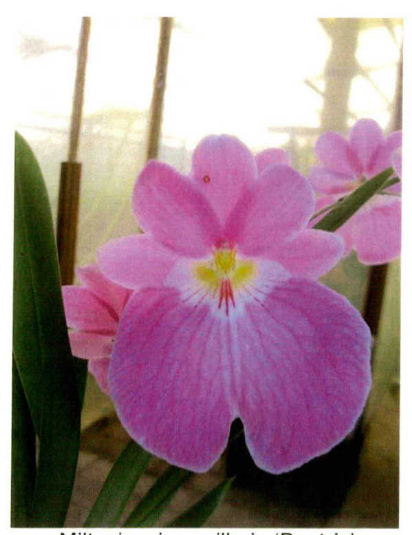
Miltoniopsis vexillaria 'Beatriz'