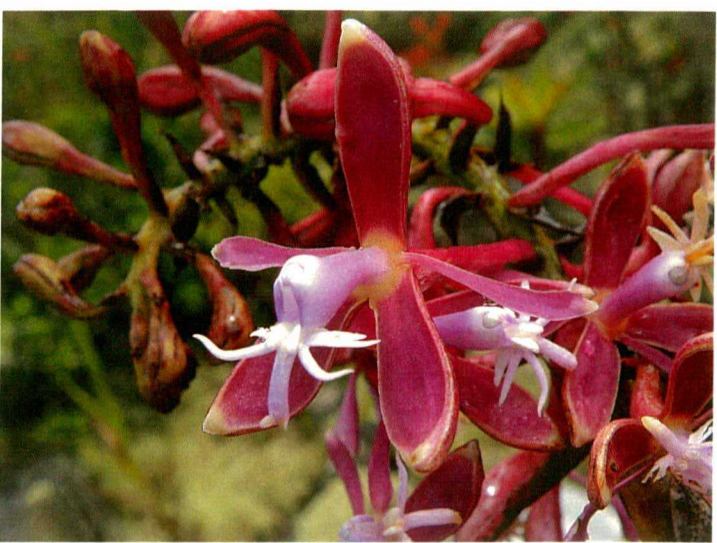
G1: Epidendrum septipartitum photo by Stig Dalstrom