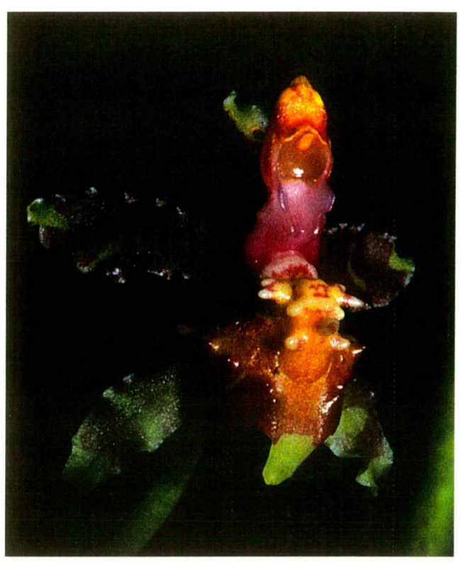
D: Cyrtochilum sharoniae