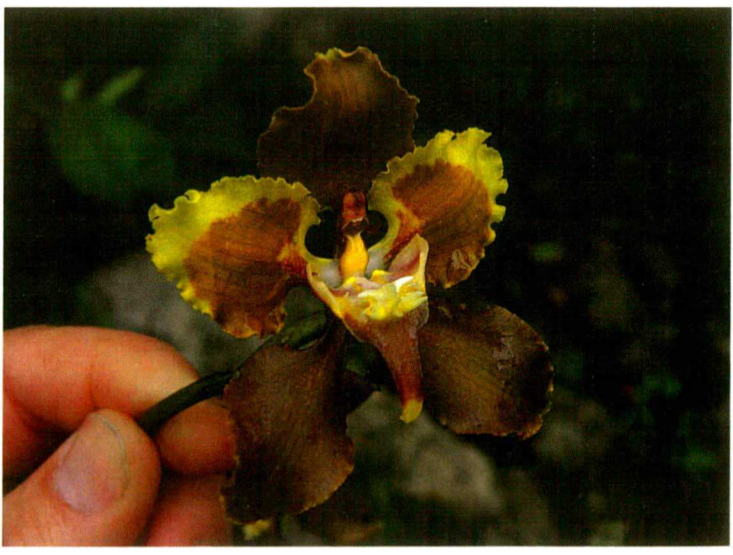
F: Cyrtochilum xanthocinctum