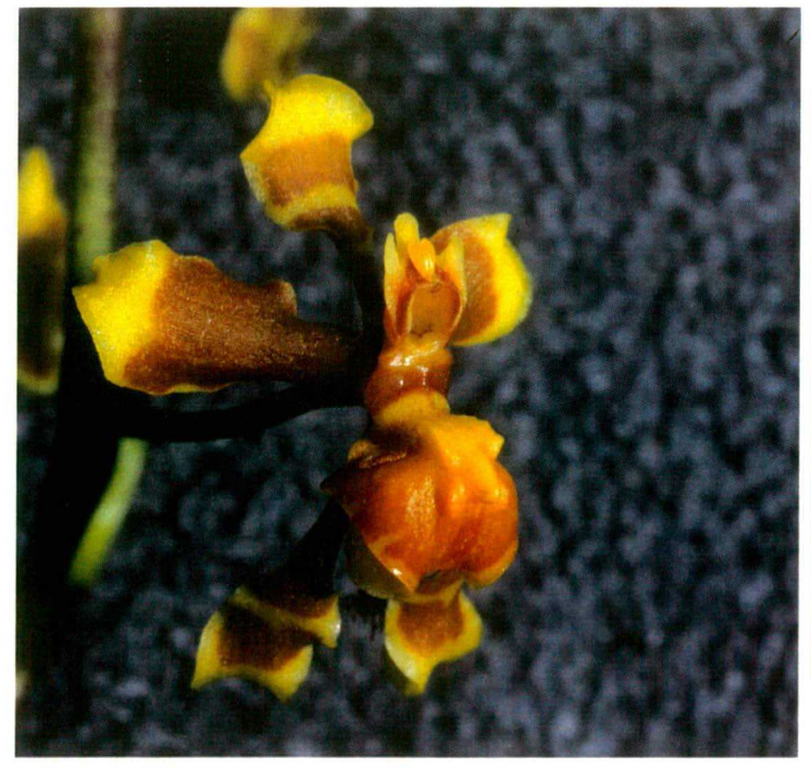
E: Cyrtochilum tricornis