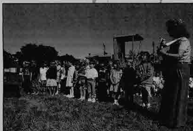
▲ Yulepa School first graders sing a song at the June 6 ground-breaking ceremony.