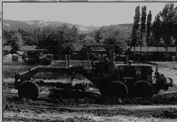
▲ The soccer fields take shape.