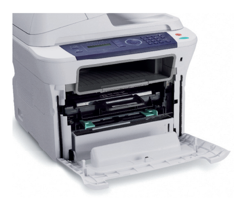
The integrated print cartridge reduces the number of separate consumables. When necessary, the front-access panel makes cartridge replacement fast and easy.

Environmental considerations in multifunction printers generally focus on reducing energy and consumables usage. Multifunction printers in this class should meet stringent Energy Star requirements, offer automatic two-sided printing to reduce paper use plus options to reduce toner consumption, and provide the means to avoid paper entirely by enabling more efficient electronic-document distribution.