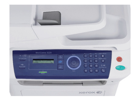
Whether printing, copying, scanning or faxing, the easy-to-navigate user interface intuitively guides users from start to finish.