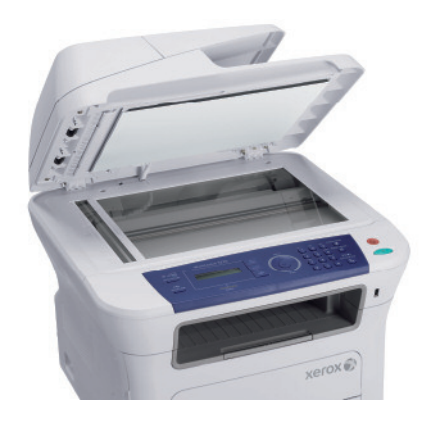
The WorkCentre 3210/3220 includes a platen glass for single-sheet copying and a 50-sheet ADF for larger copy jobs.

Consider the features that come in the box, as well. The ideal multifunction printer package should include everything needed to get the device performing on the network immediately. Security also plays a role in the value equation. Failure to protect a confidential fax, for example, could incur liabilities that far exceed the simple cost of the device.