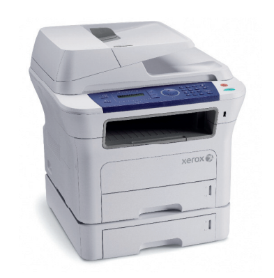
WorkCentre 3210/3220 shown with second 250-sheet paper tray (optional).

Set-up has been simplified and streamlined; the multifunction printer is easily installed and can be quickly integrated into an existing network. Most configuration, monitoring and troubleshooting can be managed from the user's computer, and the highly intuitive front panel offers large, easyto-read buttons for common functions. Its usability-conscious design gives the multifunction printer only a single customer-replaceable cartridge, keeping maintenance to a minimum.