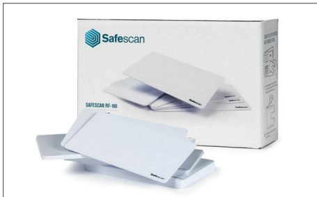
Safescan RF-100 set of 25 RFID badges Art. no: 125-0325