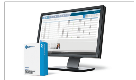
Safescan TA+ software Art.no: 125-0516