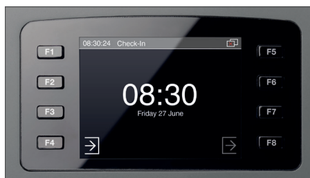
USER-FRIENDLY GRAPHICAL INTERFACE