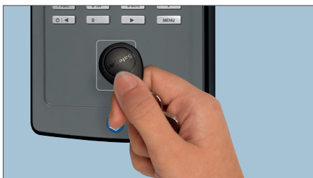
WITH RFID BADGE READER