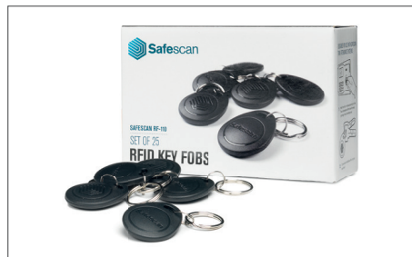
Safescan RF-110 set of 25 RFID key fobs Art.no: 125-0342