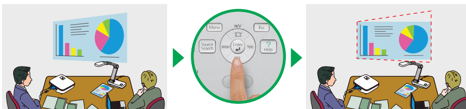
Vertical and Horizontal Keystone Correction Buttons: Achieving a perfectly-shaped image is quick and easy with the vertical and horizontal keystone correction buttons

Eliminate the need for photocopies: share 3D objects using the ELPDC06 visualiser