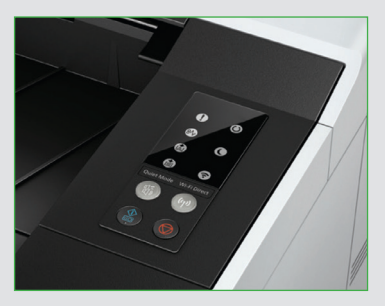
LED operator panel PG L2535