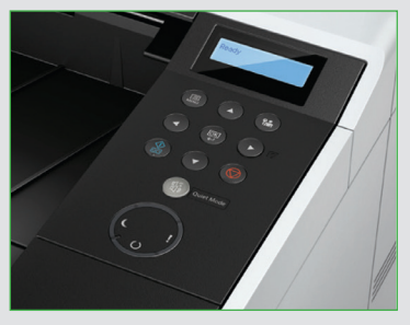
LCD operator panel PG L2540