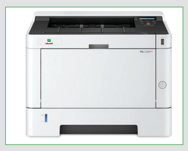
Compact and easy to manage