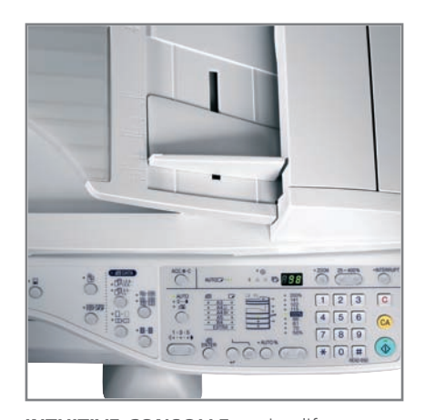
INTUITIVE CONSOLLE to simplify user access to operating funcions