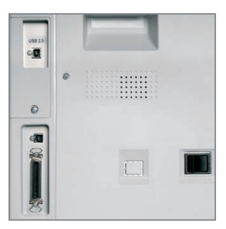
SMART SHARING FUNCTIONS allows 3 users to share the device without LAN cabling

The 1601 comes with a standard 250-sheet paper tray and 100-sheet by-pass, for a total capacity of 350 cut sheets; the 2001 features a 100-sheet by-pass and two 250-sheet paper trays for a total capacity of 600 cut sheets. The maximum paper stock is 850 sheets for the d-Copia 1601 and 1,100 sheets for the d-Copia 2001. With the optional single pass feeder , originals of up to 40 pages can be copied automatically.