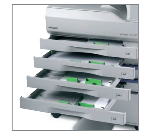
MUDULAR PAPER HANDLING