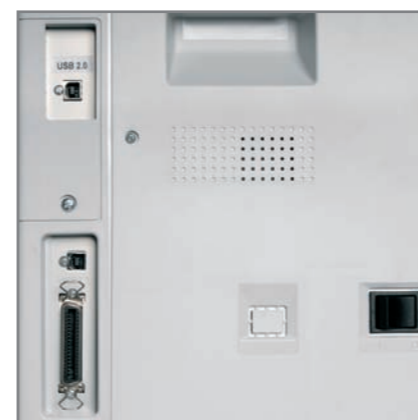
SMART SHARING FUNCTIONS allows 3 users to share the device without LAN cabling