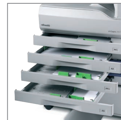
MUDULAR PAPER HANDLING