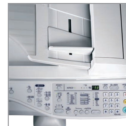
INTUITIVE CONSOLLE to simplify user access to operating functions