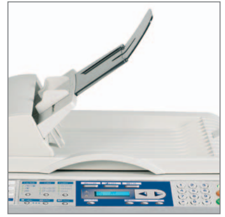
Standard 50-sheet DOCUMENT FEED