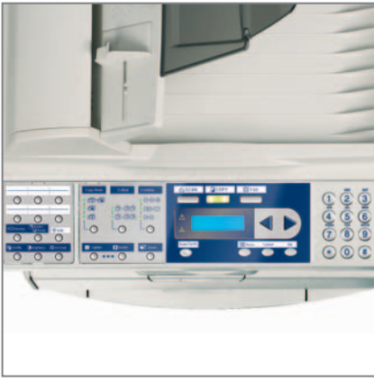
OPERATOR PANEL with copy, scan and fax function keys (fax on the d-Copia 164MF)