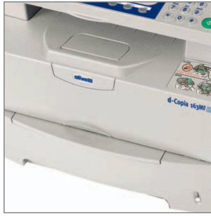
250-sheet PAPER TRAY and single-sheet BY-PASS