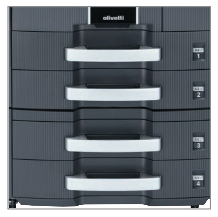
2 ADDITIONAL DRAWERS containing 500 sheets each or HIGH CAPACITY DRAWER containing 3000 sheets