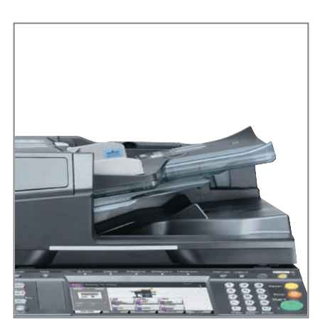
2 TYPE OF DOCUMENTS FEEDERS