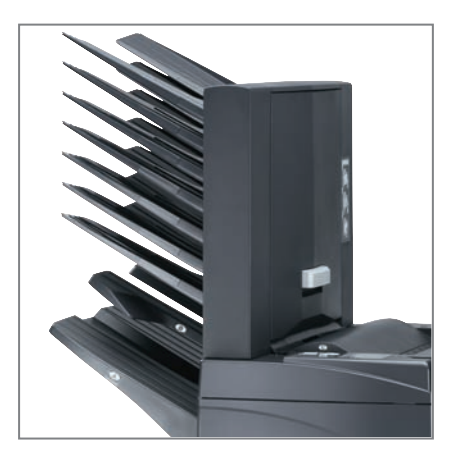
MAILBOX with 7 separate trays

The set of options offered by the d-Copia 4200MF and 5200MF is one of the most complete on the market today. This means you can custom design the configuration that best suits the customer's needs, choosing among 3 finishing units, 2 paper drawers, 2 document feeders and a series of very useful options: a hole punching unit, saddle folding and stapling, and a mailbox with 7 separate trays.