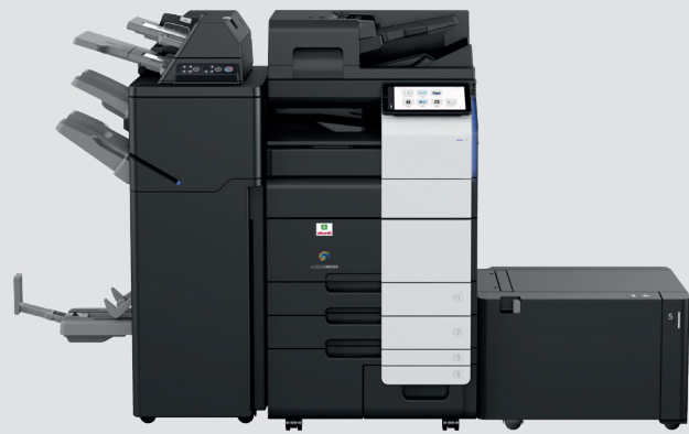
Configuration with Finisher FS-540SD, with Post-inserter PI-507 and connection unit RU-513, Side Drawer LU-207