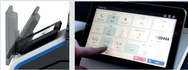
Adjustable 10.1" colour multi-touch panel