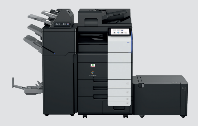
Configuration with Finisher FS-540SD, with Post-inserter PI-507 and connection unit RU-513, Side Drawer LU-207