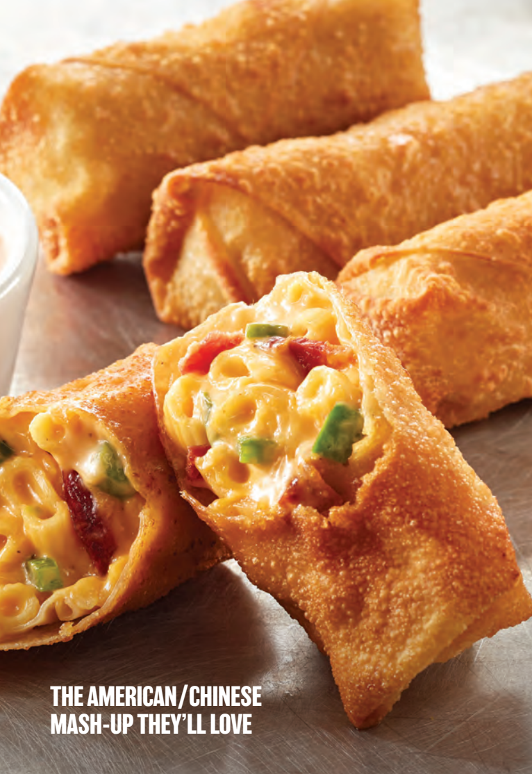
THE AMERICAN/CHINESE MASH-UP THEY'LL LOVE