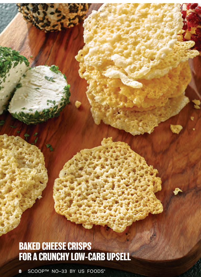
BAKED CHEESE CRISPS FOR A CRUNCHY LOW-CARB UPSSELL