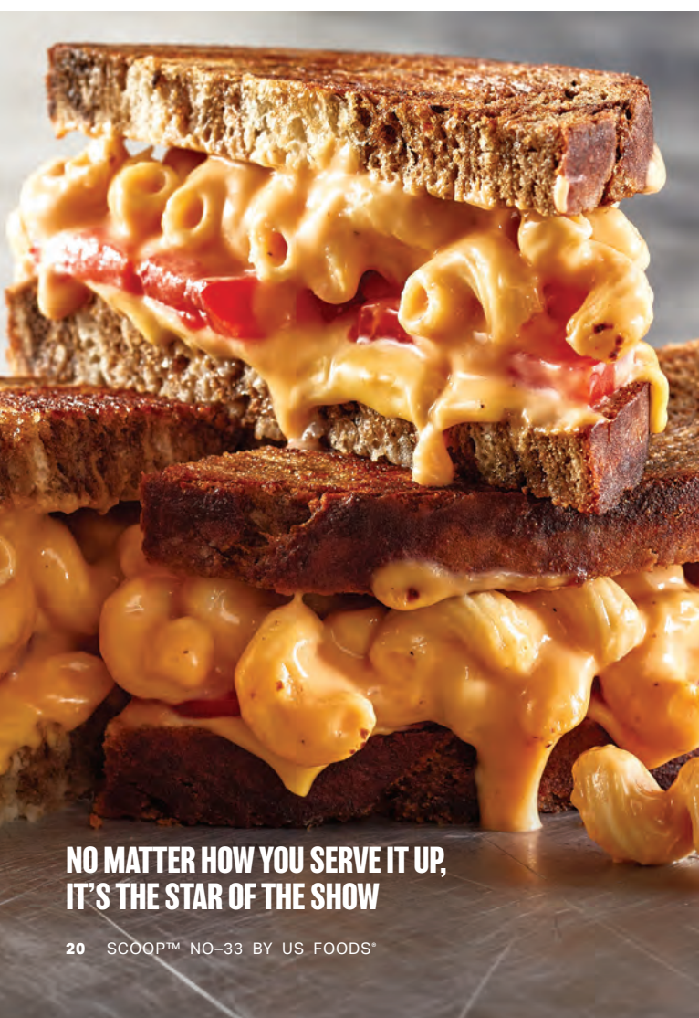
NO MATTER HOW YOU SERVE IT UP, IT'S THE STAR OF THE SHOW