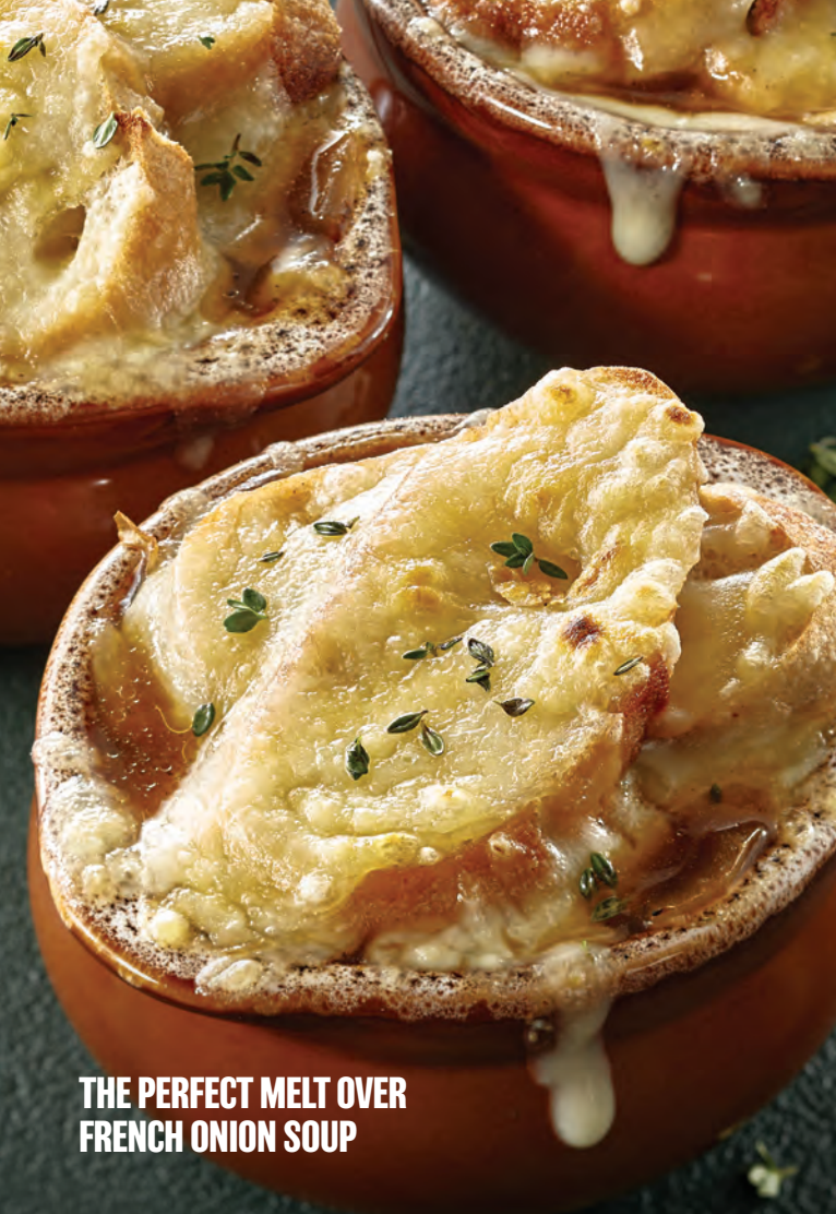
THE PERFECT MELT OVER FRENCH ONION SOUP