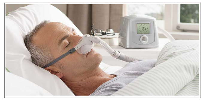
Figure 2: Illustration of a CPAP Machine in a Hypothetical Patient with OSA and PTSD

The link between OSA and PTSD have been proposed due to their common and overlapping clinical features. These two distinct conditions if left untreated, have a detrimental effect on the maintenance of normal sleep patterns, affecting daytime functioning and quality of life. Both disorders seem to affect and perpetuate each other, creating persistence of sleep difficulties. Sleep fragmentation and disruptions have serious medical and mental complications. Clinicians are strongly advised and urged to consider OSA as an undiagnosed entity in patients with PTSD and vice versa to explore the possibility of PTSD as a confounding factor contributing to the frequent awakening associated with OSA. Treatment options include CPAP therapy for OSA and both pharmacologic and nonpharmacological interventions in PTSD .An astute assessment and management of OSA and PTSD despite its inherent difficulties and challenges will ultimately lead to improved sleep, remission of disabling symptoms and restoration of daily functioning and quality of life.