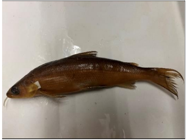
Lake Whitefish (unknown form) from Opeongo Lake preserved at the ROM (200 mm SL).