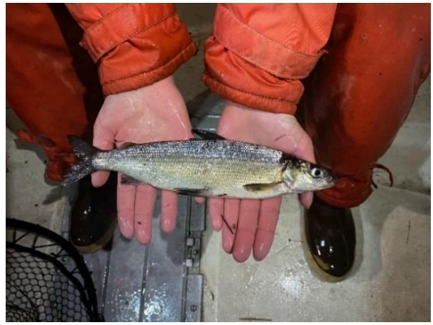
Lake Whitefish (unknown form) from Opeongo Lake, fish length not provided.