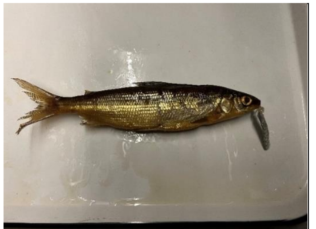
Lake Whitefish (unknown form) from Opeongo Lake preserved at the ROM (182 mm SL).

Photographs of Lake Whitefish from Opeongo Lake are provided below in Figure 1.