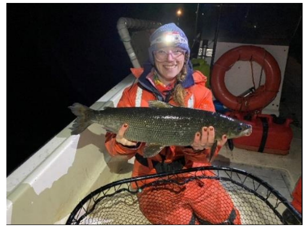
Lake Whitefish (large-bodied form) from Opeongo Lake, fish length not provided.