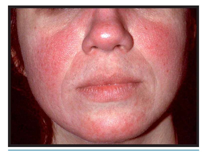
Figure 1. Erythematotelangiectatic rosacea: persistent centrofacial erythema and telangiectasia.

Erythematotelangiectatic rosacea (ETR) is defined by the presence of one or more of the following: persistent central facial erythema, flushing (transient erythema), telangiectasia, dryness, topical sensitivity or facial edema (Figure 1) [11]. Based on these criteria, patients with solely telangiectasia may be given the diagnosis of ETR. As such, some argue that the ETR criteria is not stringent enough and may inadvertantly include erythematotelangiectatic photoaging, which also presents with facial telangiectasia [12]. The presence of symptomatic flushing and/or topical sensitivity can help discriminate ETR from photoaging, as photoaging is generally asymptomatic [13]. The typical flush of rosacea generally involves the central face and lasts longer than 10 min [14]. Flushing may be triggered by a variety of emotional stimuli such as anxiety and stress, as well as external stimuli such as heat, wind, spicy foods and alcohol. It is important to distinguish rosacea flushing from other more serious causes of flushing, such as carcinoid syndrome and pheochromocytoma. These entities are generally associated with other features such as gastrointestinal symptoms in carcinoid syndrome and hypertension in pheochromocytoma [15].