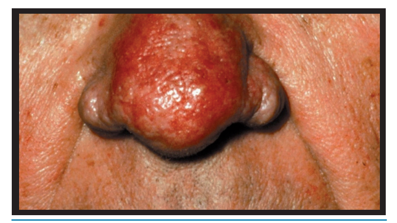
Figure 3. Phymatous rosacea. Skin thickening and enlargement of nose. Patient also has persistent erythema and telangiectasia.

One long considered theory is that UV light exposure contributes to rosacea. Rosacea occurs on the face, a chronically sun-exposed location, and studies have shown that photosensitive skin type is a risk factor for rosacea development [20,31]. Flushing may be provoked by acute sun exposure in some rosacea patients [31]. Acute