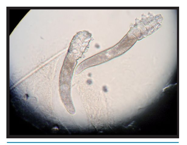
Figure 5. Light microscopy of Demodex mites obtained from surface skin scraping.

Recently, in the British Journal of Dermatology , Lacey and colleagues suggested that Demodex mite itself is not the problem, but instead a bacteria harbored within the mite [56]. They isolated one such bacterium, Bacillus oleronius , from a Demodex mite. A peripheral blood mononuclear cell proliferation assay was performed and they found that patients with PPR were more immunoreactive to B. oleronius than those without. This suggests that the bacteria, rather than the mite, could be initiating an immune response creating the inflammatory papules and pustules seen in rosacea. B. oleronius is susceptible to tetracycline type antibiotics [56] and this theory could explain the effectiveness of tetracyclines in the treatment of rosacea. A subsequent study of 59 patients with various ocular surface diseases noted a significant association