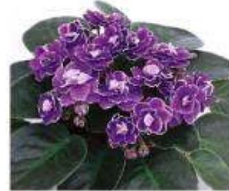
Yellowstone # 30269