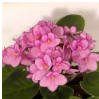
Michele # 30298