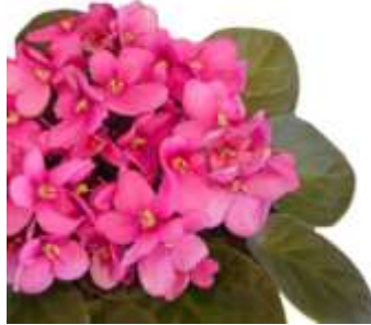
Cindy # 30350