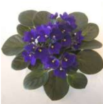
Kentucky # 30023