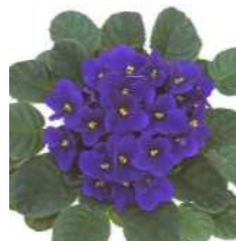
Miho # 30013