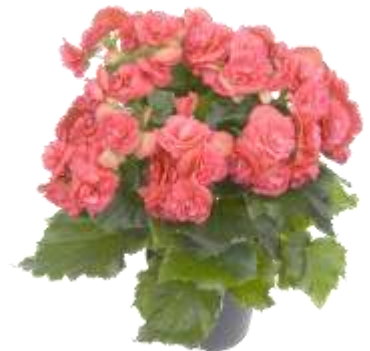
Binos Pink # 36058