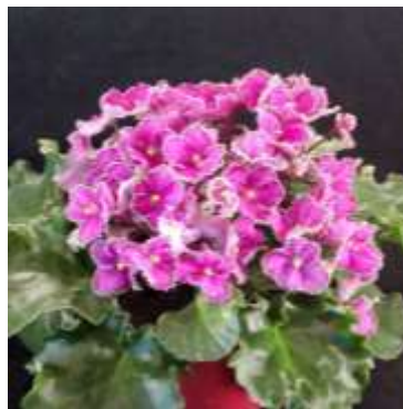
Ever Glory #10569