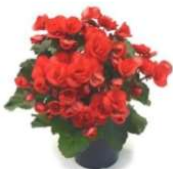
Veronica # 36085