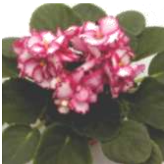
Susi # 30100