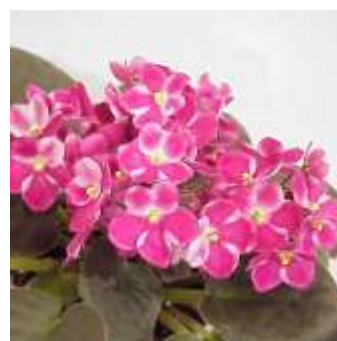
Millennia # 30013