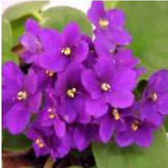
Wisconsin # 30016