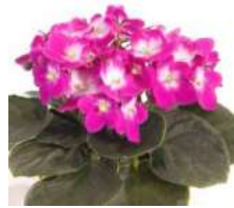
Dali # 30728