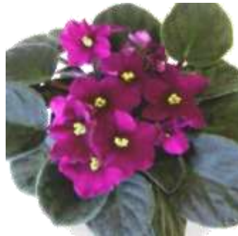
Pennsylvania # 30073