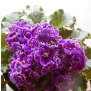
Ever Beautiful #10590