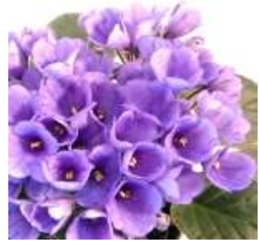
AnnaBelle # 30820