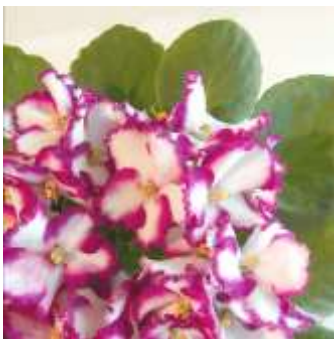
Harlequin # 30397