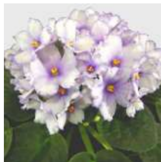
Tennessee # 30090