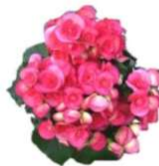
Sandrine # 36090