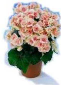
Kristy Fringed # 36021