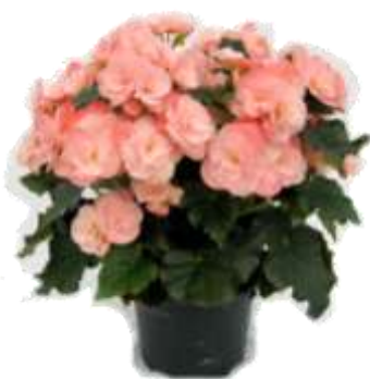
Dragone Champagne # 36084