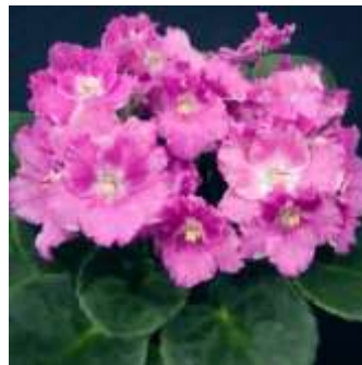
Seurat # 30752