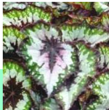
35007 Her Majesty