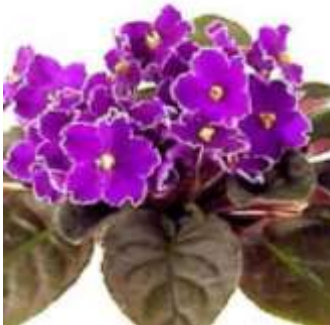
Hawaii # 30096