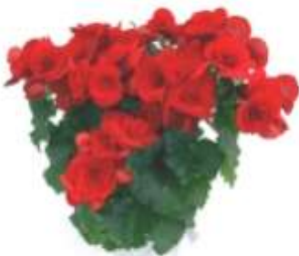
Berseba Red # 36055