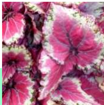
35016 Pink Charming