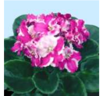
Gisela # 30299