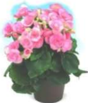
Nelly # 36014