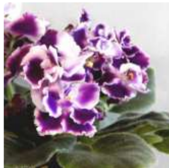
Cora # 30014