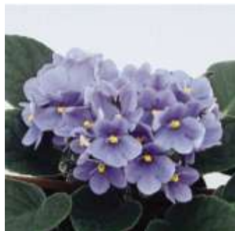
Manitoba # 30002