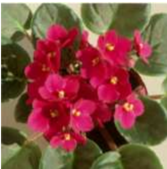
Scarlet # 30070