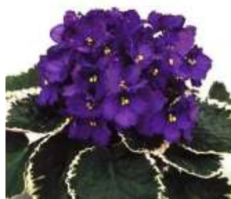
Modesty # 30713