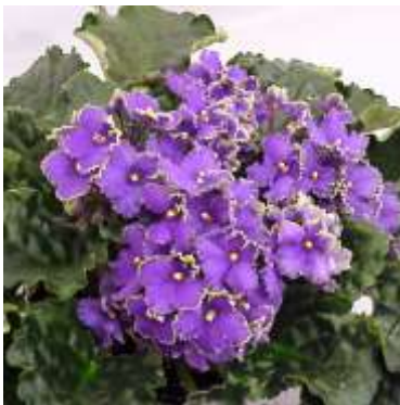
Ever Praise #10544