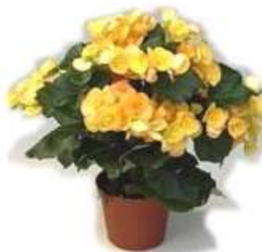
Eva # 36117