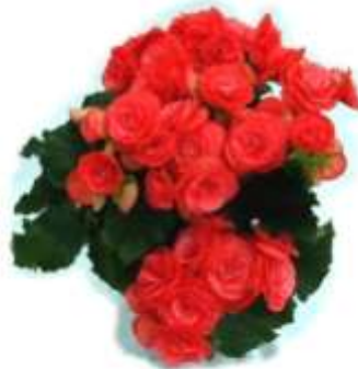
Binos # 36075