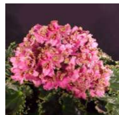
Ever Rejoice #10577