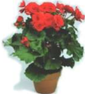
Balamon # 36073