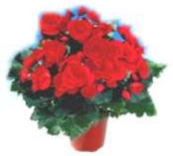
Barkos # 36032