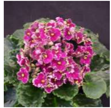
Ever Love #10545