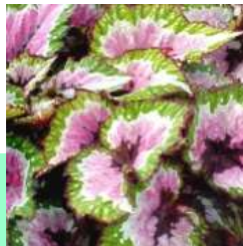
35012 Merry Christmas