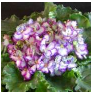
3 EverPrecious #10575