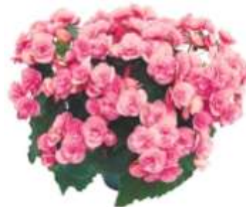
BonBon # 36088