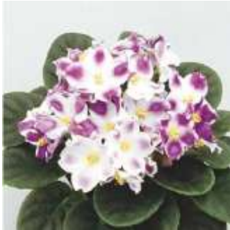
Gauguin # 30783