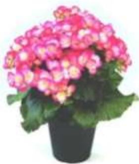
Peggy # 36069