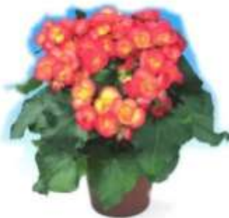
Carneval # 36005