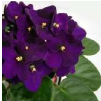
Wyoming # 30019