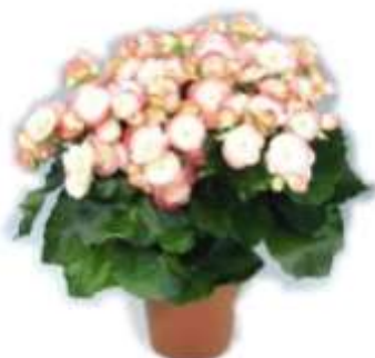
Camilla # 36004