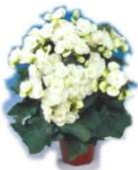
Clara # 36006