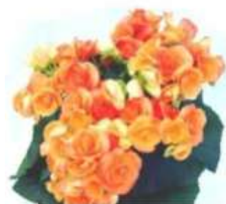
Britt Dark # 36003