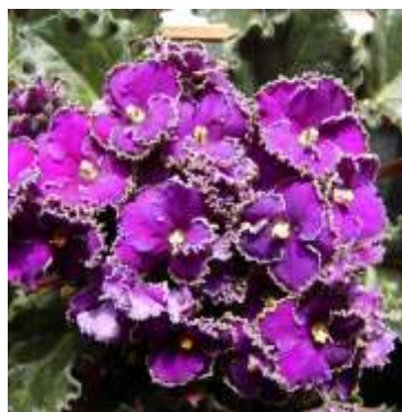
Ever Joy #10578