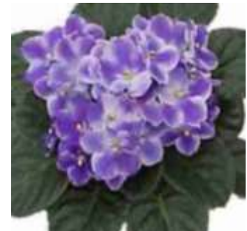
Sami # 30241