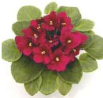
Colorado # 30063