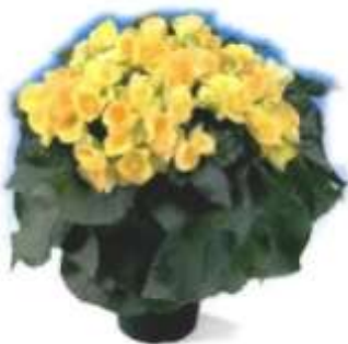
Nadine # 36013