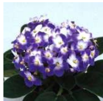
Michaelangelo # 30717