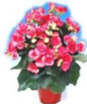
Netja Dark # 36015