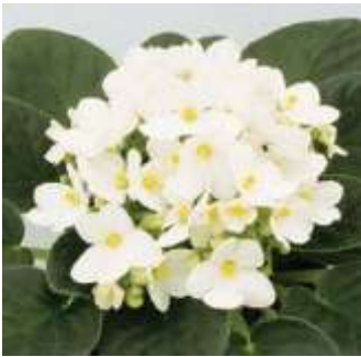
Ontario # 30748