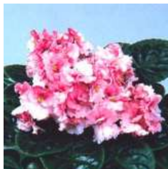
Louisiana # 30046