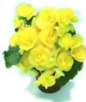
Blitz # 36095