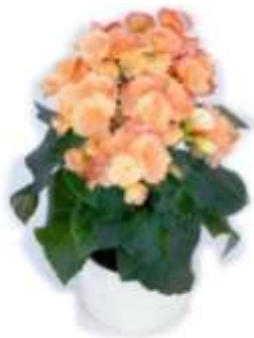
Janny Fringed # 36020