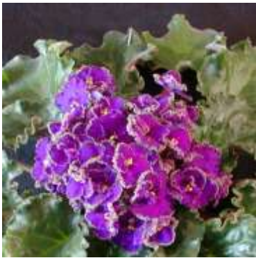
Ever Special #10576