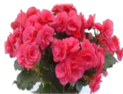
Dragone # 36066