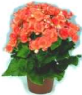
Batik # 36002