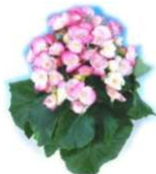
Cindy Fringed # 36017