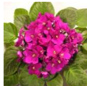
North Carolina # 30069