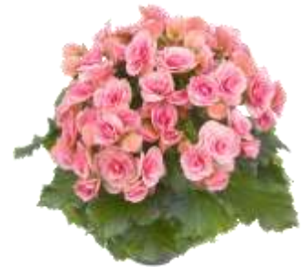
Berseba Light Pink # 36064