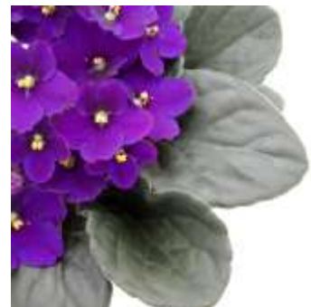
Evelyn # 30017