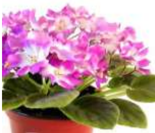
Degas # 30763