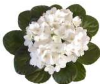
Montana # 30279