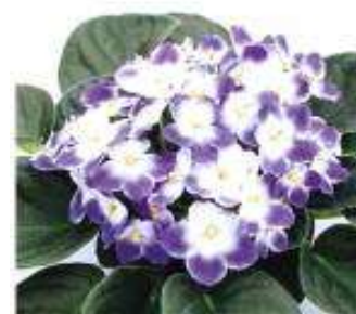
Monet # 30735