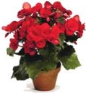
Baladin # 36072