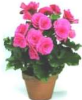
Berseba # 36074