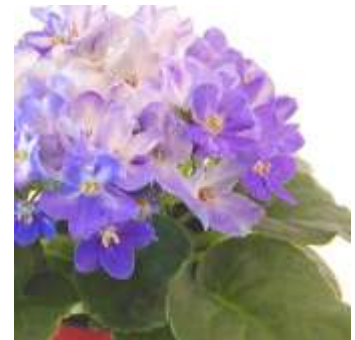
Hiroshige # 30782