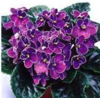
Maui # 30285