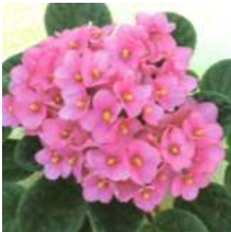
Indiana # 30040