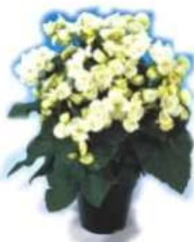
Clara Fringed # 36018