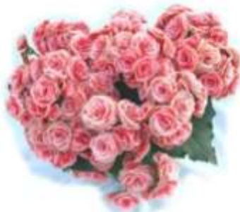
Borias # 36048