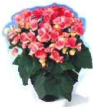
Netja Fringed # 36023