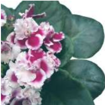
Rita # 30399