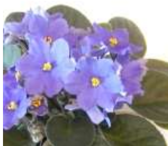
Natalie # 30250