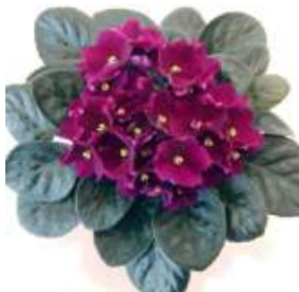
Delaware # 30072