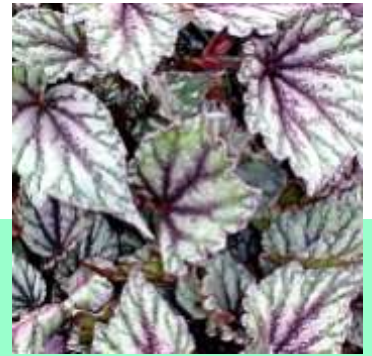
35005 Dew Drop