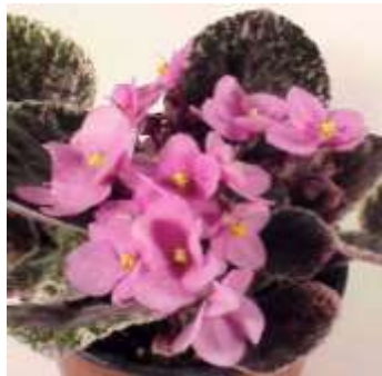
Romance # 30751