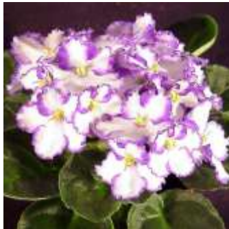
Chico # 30244