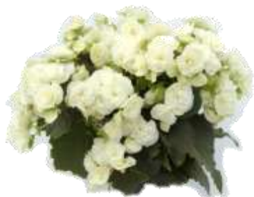
Bonbon White # 36167