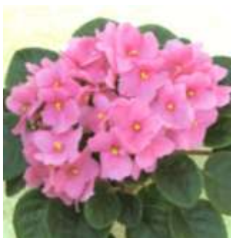
Michigan # 30054