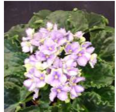
Ever Grace #10543