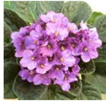
Connecticut # 30278