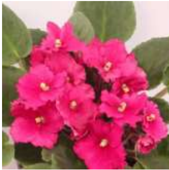
Georgia # 30050