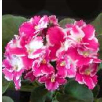
Anika # 30748