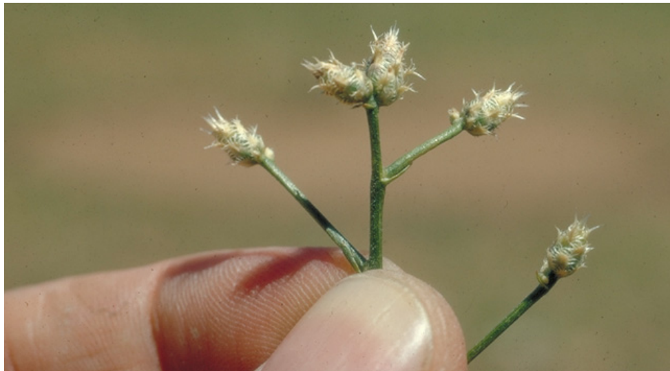
Squarrose knapweed buds, photo by Dan Sharratt, ODA

Growth Habits, Reproduction, and Spread: Squarrose knapweed is a long-lived perennial with deep roots and a large crown. Rosettes will grow slowly for a number of years before blooming. Flower heads are smaller than the other knapweeds, showing rose-colored flowers beginning in early to mid June and having up to eight seeds per head. The terminal bracts around the flower heads are enlarged and recurved. Squarrose knapweed is not a showy plant and may escape detection if found in the presence of other knapweeds. The heads readily detach from the plants when mature, acting as a very effective dispersal mechanism by catching in animal hair and on clothing. Whole plants can also detach and tumble with the wind dropping seed heads as they go. The seed heads do not open at maturity, ensuring that they are dispersed far from the parent plant and slowly shaken out over time. Sheep are heavily implicated in the spread of squarrose knapweed. Agricultural activities are responsible for long distance dispersal through hay and livestock movements, equipment transport and possibly, in contaminated seed. Wind, wildlife and livestock are important factors in localized movement.