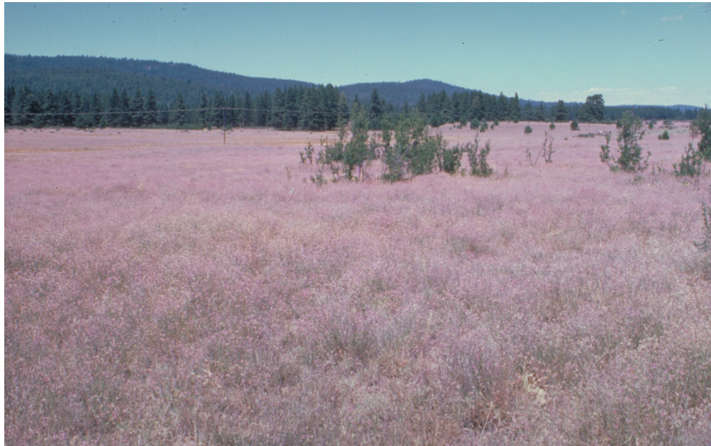
Squarrose knapweed infestation in California

There are seven infested counties in Northern California (second largest infestations compared to Utah), with most infestations under intensive chemical control, though some of the larger sites in Shasta and Lassen Counties are being evaluated for biocontrol with some promising results (CDFA Noxious Times Vol 7 No. 2). Nevada hosts infestations in three counties with Utah containing 200,000 acres in its West-Central region. The plant is reported to be eradicated in Montana.