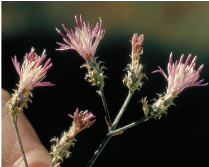
Squarrose knapweed flowers

Findings of This Review and Assessment: Squarrose knapweed, Centaurea virgata , was evaluated and determined to be a category “ A ” rated noxious weed, as defined by the Oregon Department of Agriculture (ODA) Noxious Weed Policy and Classification System. This determination was based on a literature review and analysis using two ODA evaluation forms. Using the Noxious Qualitative Weed Risk Assessment v.3.6, squarrose knapweed scored 62 indicating a Risk Category of A ; and a score of 17 with the Noxious Weed Rating System v.3.2, indicating an A rating.