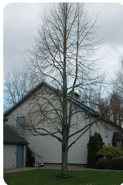
Winter habit of Tilia x europaea