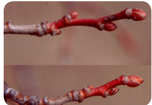
Winter twig Tilia cordata