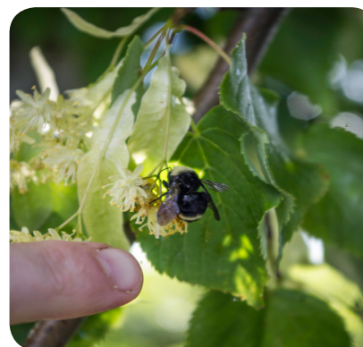
Bumble bee on a Tilia flower