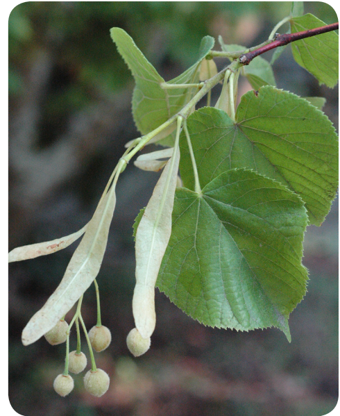
Fruit with brack and leaves