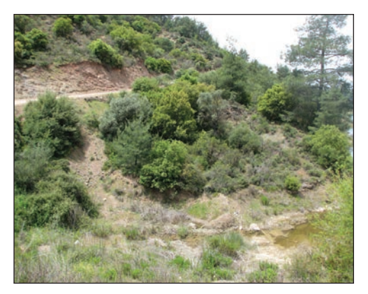
Plate II. Cyprus Wheatear Oenanthe cypriaca habitat by Kannaviou dam, Cyprus, with pine, olive, golden oak and thorny broom, May 2011.

shrubs in the central lowlands and badlands (Kuşkor 1999–2003). Some also breed on the open rocky slopes used by wintering finschii (Neophytou et al 1972, Flint 2000b, Alison McArthur pers comm). It is noteworthy that apparently similar wintering habitats of finschii in Jordan and Israel are occupied in summer by breeding melanoleuca (Andrews 1995, Shirihai 1996). Around coasts cypriaca is often common where the hills reach the sea and there are cliffs, or where it is rocky, but on coastal plains near Pafos and Kyrenia it is scarce or absent (Colin Richardson pers comm, PF pers obs).