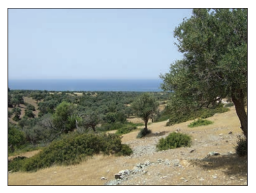
Plate 15. Cyprus Wheatear Oenanthe cypriaca habitat with olive and carob, Lara, Akamas, Cyprus, May 2010.

one occasional breeder, as well as nine migrant breeding warblers (Brooks 1998) compared with three on Cyprus.