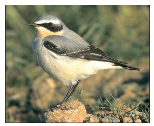
Plate I. Northern Wheatear Oenanthe oenanthe male, Pano Arodes, Cyprus, I April 2004.

Black-eared Wheatear subspecies melano-leuca (Plates 2 & 3) is a fairly common spring migrant with peak numbers late March-mid April (Flint & Stewart 1992, Richardson 2010). There are several June records and it probably bred in 2009 (Randler & Crabtree 2010), though in May 2010 none were at the 2009 probable breeding site (Alan Crabtree per Derek Pomeroy pers comm). Although some authors consider it might be a scarce