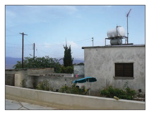
Plate 16. Cyprus Wheatear Oenanthe cypriaca habitat, Kritou Terra village, Cyprus. The poles, TV aerial and bare tree top are used every year as song posts, October 2010.