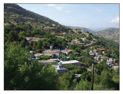
Plate 18. Cyprus Wheatear Oenanthe cypriaca habitat, Episkopi village, Cyprus, June 2011.