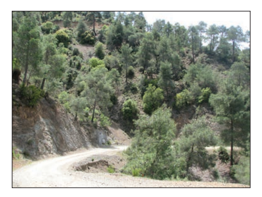
Plate 12. Cyprus Wheatear Oenanthe cypriaca habitat with pine and golden oak in the Pafos forest, Cyprus, May 2011.