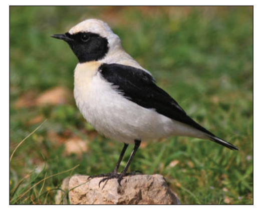
Plate 2. Black-eared Wheatear Oenanthe hispanica melanoleuca male black-throated morph, Meleti, Cyprus, 24 March 2009.