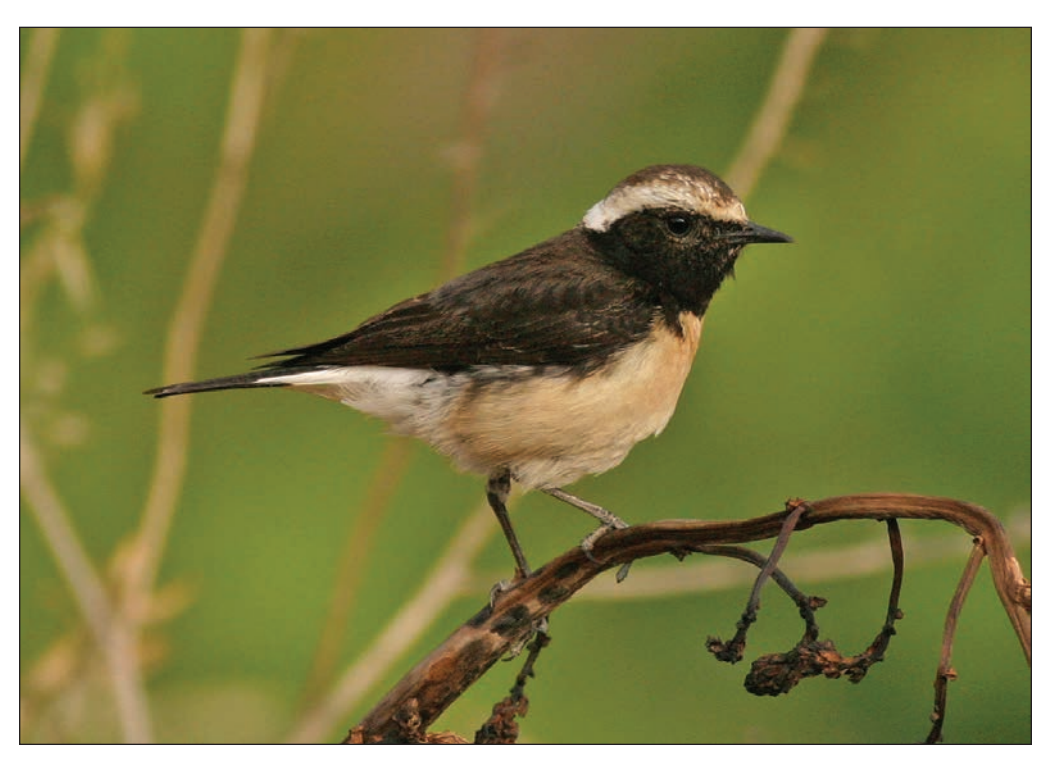
Plate 7. Cyprus Wheatear Oenanthe cypriaca female, Agia Varvara, Pafos, Cyprus, 16 May 2008.