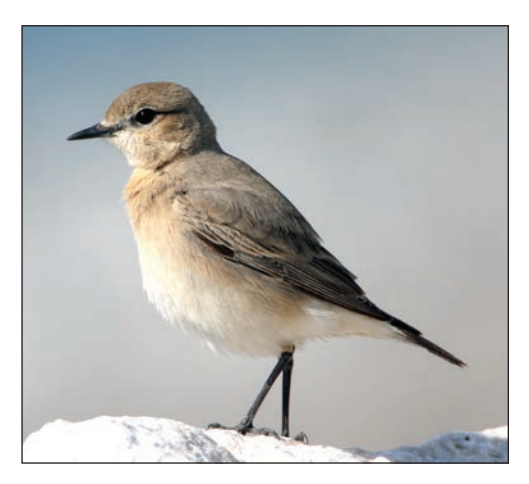
Plate 4. Isabelline Wheatear Oenanthe isabellina, Pano Arodes, Cyprus, 3 April 2011. © David Nye