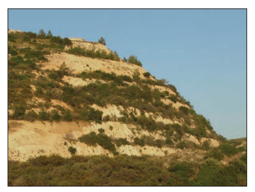
Plate 13. Cyprus Wheatear Oenanthe cypriaca habitat with spiny gorse, pine and carob by Evretou dam, Cyprus, May 2011.

The habitats occupied by a species often vary between the mainland and islands, and between islands, depending on which other species are present (Lack 1969). In Greece oenanthe breeds in open habitats with sparse low vegetation at medium and high altitudes, and is largely replaced by melanoleuca below 500 m. But on the eastern Aegean islands it breeds commonly down to sea level, and on Limnos (where melanoleuca is rare) it reaches a remarkably high density and also breeds in the villages and in the town, perching on buildings (Handrinos & Akriotis 1997). In this respect it appears similar to cypriaca on Cyprus.