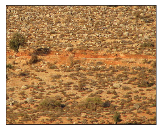
Plate 20. Winter habitat of Finsch's Wheatear Oenanthe finschii with olive and hawthorn on the south side of the central Kyrenia range, Cyprus, November 2010. Also spring/summer habitat of Cyprus Wheatear Oenanthe cypriaca .

Because of their taxonomic closeness, hybridisation between cypriaca and melanoleuca is a possibility (Randler & Crabtree 2010). But so far, apart from a male with a 'black head' (Richardson 2009), there are no records in the Cyprus literature and no recent reports (Colin Richardson pers comm) of unusual or aberrant plumage in cypriaca , nor of the plumage morphs (Panov 2005) which might be expected were hybridisation to occur, although they have been looked for.