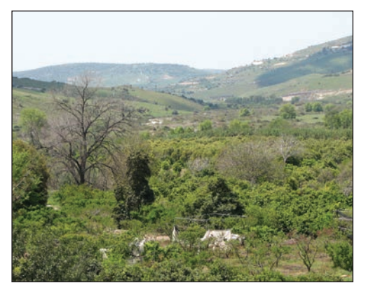
Plate 9. Cyprus Wheatear Oenanthe cypriaca habitat above Nata, Cyprus, citrus orchard with some deciduous trees, April 2011.

temperatures and lower maximum summer temperatures and is mainly less arid (de Pauw 2008). Also it breeds in high mountain ranges in Syria and Lebanon (Shirihai 1996), and largely above 500 m in Turkey (Kirwan et al 2008). Thus on Cyprus only the higher mountains might be climatically suitable for it to breed.