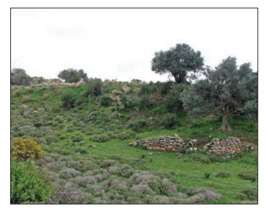
Plate 10. Cyprus Wheatear Oenanthe cypriaca habitat with olive, carob and thorny gorse, East Peyia, Cyprus, April 2011.