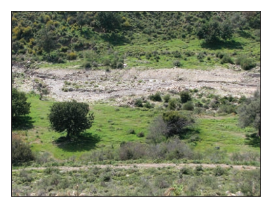
Plate 14. Cyprus Wheatear Oenanthe cypriaca habitat with carob and olive in the Xeros valley east of Peyia, Cyprus, April 2011.