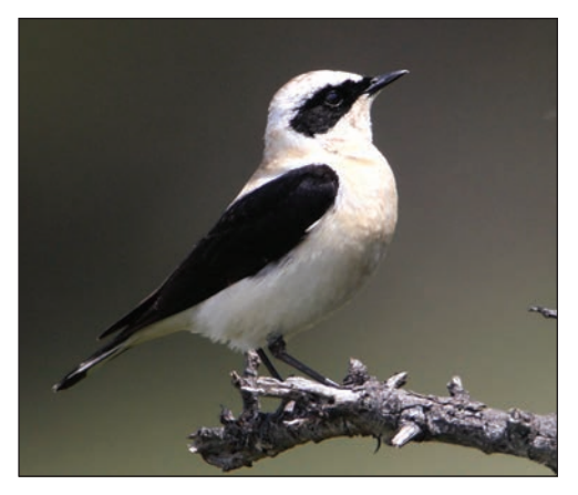
Plate 3. Black-eared Wheatear Oenanthe hispanica melanoleuca male white-throated morph, Pano Arodes, Cyprus, 3 April 2011.

Finsch's Wheatear (Plate 5) is a locally common winter visitor mainly November–February to open rocky slopes below 600 m; usually all have left by mid–late March, with no records after early May nor of breeding (Flint & Stewart 1992, Richardson 2010). Its Middle Eastern breeding range (Porter & Aspinall 2010) lies mainly north of the latitude of Cyprus, has lower mean annual