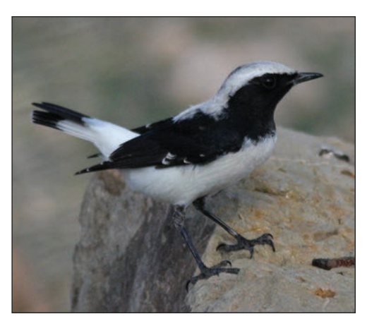
Plate 5. Finsch's Wheatear Oenanthe finschii male, Anarita Park, Cyprus, 25 October 2008.