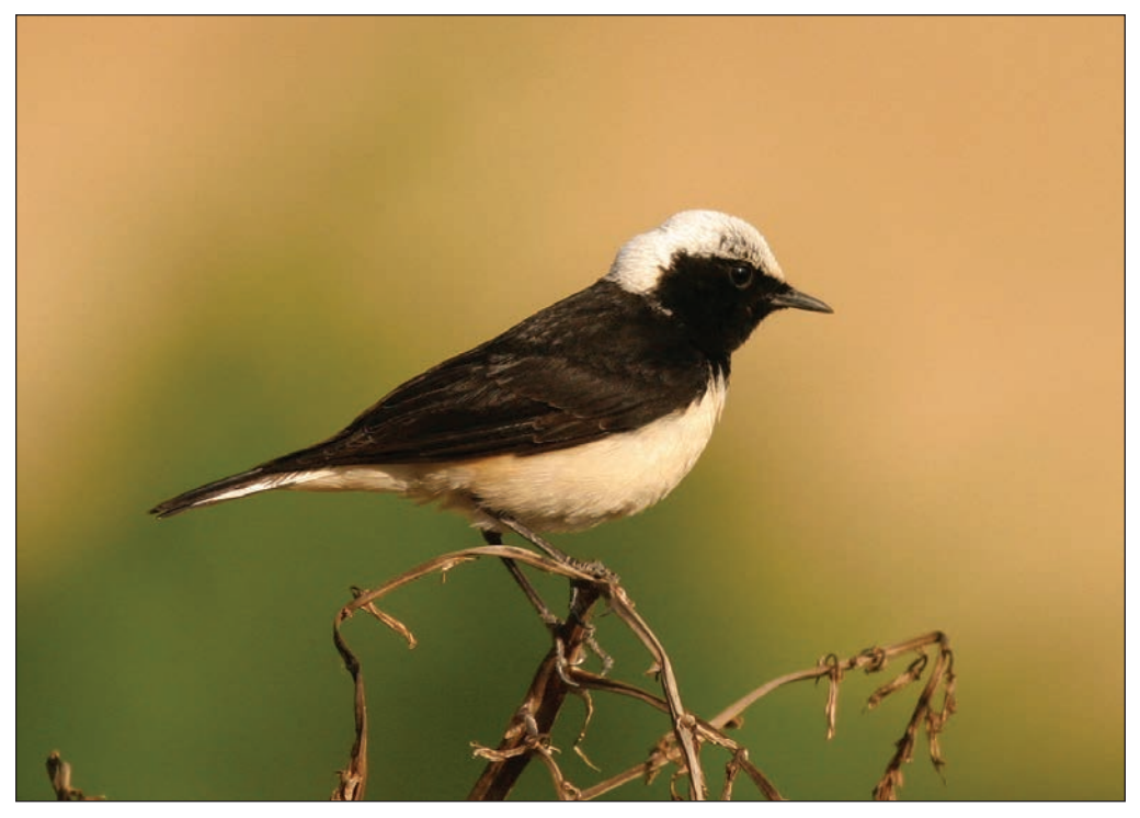
Plate 6. Cyprus Wheatear Oenanthe cypriaca male, Agia Varvara, Pafos, Cyprus, 16 May 2008.