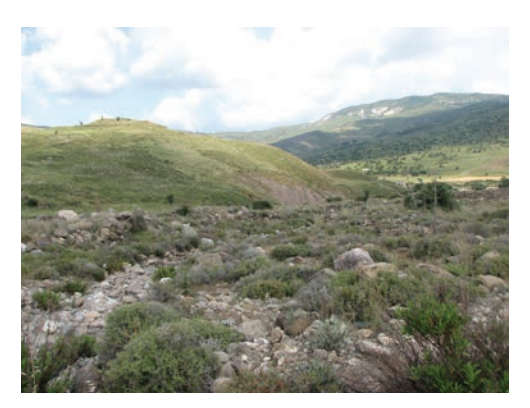
Plate 19. Cyprus Wheatear Oenanthe cypriaca habitat near Sindi monastery, Cyprus, with hawthorn, thistles and spiny burnet, May 2011. Also winter habitat of Finsch's Wheatear Oenanthe finschii.

a c 13 times increase in area doubles the species total (Flint & Stewart 1992) and species/ area graphs indicate that for its area Cyprus might be expected to hold c 70–80 breeding species (Iapichino & Massa 1989, Flint & Stewart 1992), which is close to the current total of 81 (BirdLife Cyprus 2011). For these reasons it seems probable that the island is at or near equilibrium, where competition from established species means almost no new colonists will succeed (MacArthur & Wilson 1967). This appears to be so on Cyprus, where at least 11 other small passerines have bred, or possibly/probably bred in the past, some of them several times, without colonising (Flint & Stewart 1992, BirdLife Cyprus 2011).