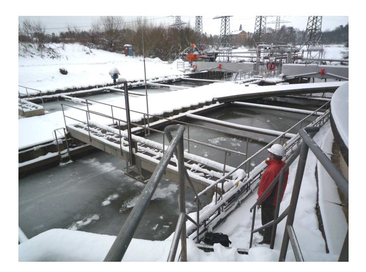
Site visit at the plant inflows 1 and 2