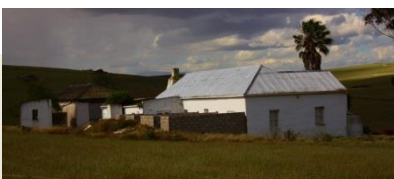
Photographs left and below: House (for research center) and view from Haarwegskloof farm – soon to be Nature Reserve.