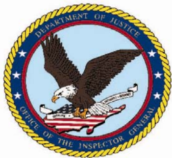
U.S. Department of Justice Office of the Inspector General