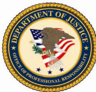
U.S. Department of Justice Office of Professional Responsibility