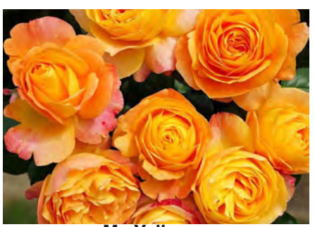
My Yellow Available Wagner's Roses 2019

My Yellow (Brunsam)-Bred by Bruce Brundrett in Australia. This new rose is exceptionally quick to produce fragrant blooms, with new growth commencing before the blooms are spent. The colour rarely fades with the sun, usually deepening the yellow hue to orange flushes. the blooms have a strong fragrance and the bushes grow to a height to 80cm.