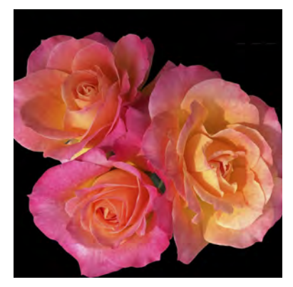
2013 Joyce Abounding