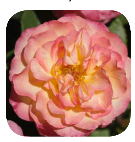
The Opportunity Rose