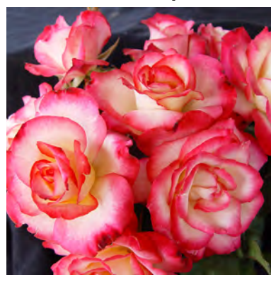
2017 Love's Gift