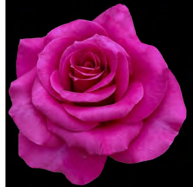
2014 Flemington Racecourse