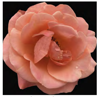
2016 China Sunrise