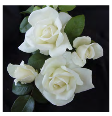
2018 Amazing Grace