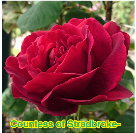
Countess of Stradbroke-