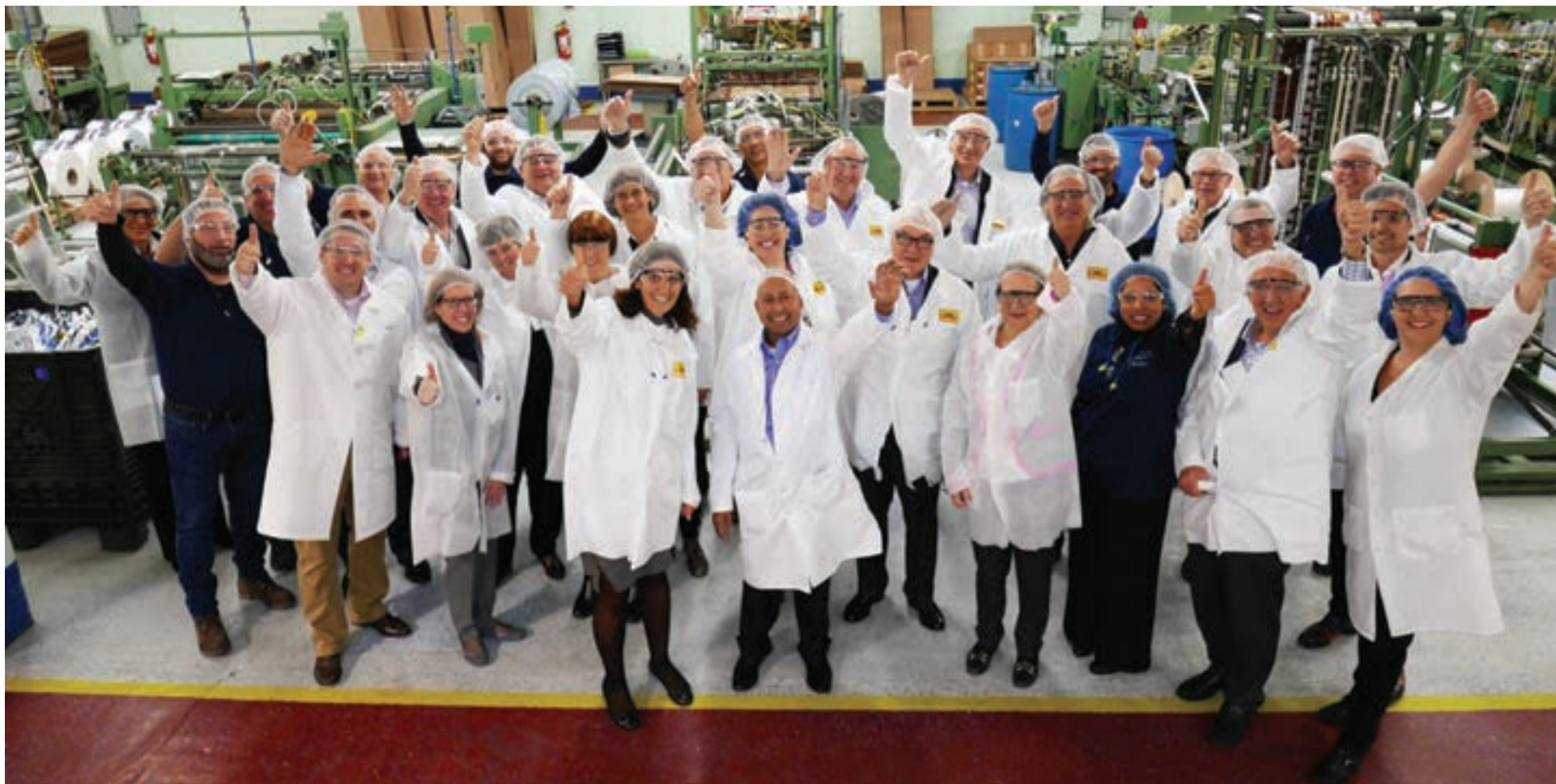
Members of TC Transcontinental's Board of Directors and Senior Executive Committee pose for a group shot at the company's packaging facility in Brooklyn, N.Y., in an exuberant display of enthusiasm for the company's ongoing growth and transformation into one of the world's largest integrated producers and converters of flexible packaging products.