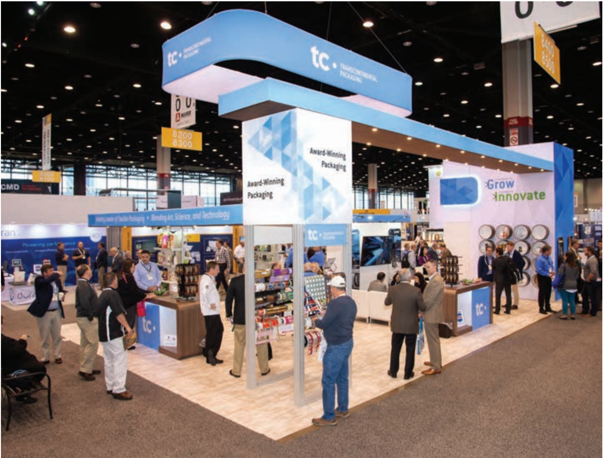
TC Transcontinental Packaging exhibiting the company's fast-growing range of flexible packaging innovations and sustainability solutions at last fall's PACK EXPO International 2018 packaging technologies exhibition in Chicago, generating a lot of positive feedback from the show's visitors and many other exhibitors.

is what he set out to do with TC Transcontinental.