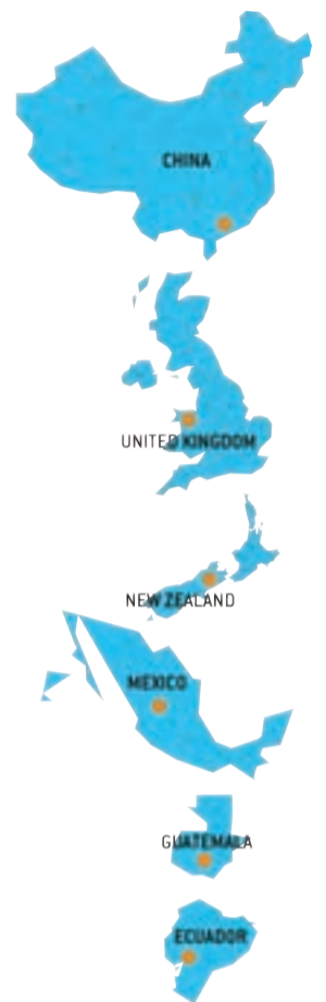
A graphic snapshot of TC Transcontinental Packaging’s expansive global asset base following its high-profile acquisition of Coveris Americas last year.