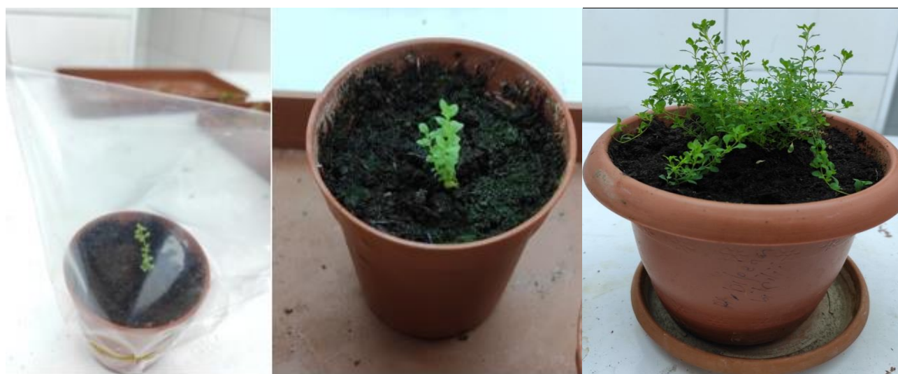
Fig. 4. Covering H. bilgehan-bilgii with plastic nylon wrap and providing soil adaptation.

(Shilpashree & Rai, 2009); H. umbellatum A. Kern. and H. richeri ssp. transsilvanicum , endemic and endangered species in Romania (Coste et al. , 2012); H. scabroides , an endemic species in Turkey (Asan et al. , 2015); H. gaitii , a medicinal plant in the Himalayas including, Afghanistan, Bhutan, Nepal and Pakistan (Swain et al. , 2016); H. aviculariifolium Jaub. & Spach, and H. pruinatum Boiss. & Balansa ex Boiss., endangered species in the flora of Turkey (Cirak et al. , 2020); and H. adenotrichum (Yamaner & Erdağ, 2020) under In vitro conditions, different types of cytokines and their different combinations have been used, and they report that the cytokine hormone is quite effective for shoot development.