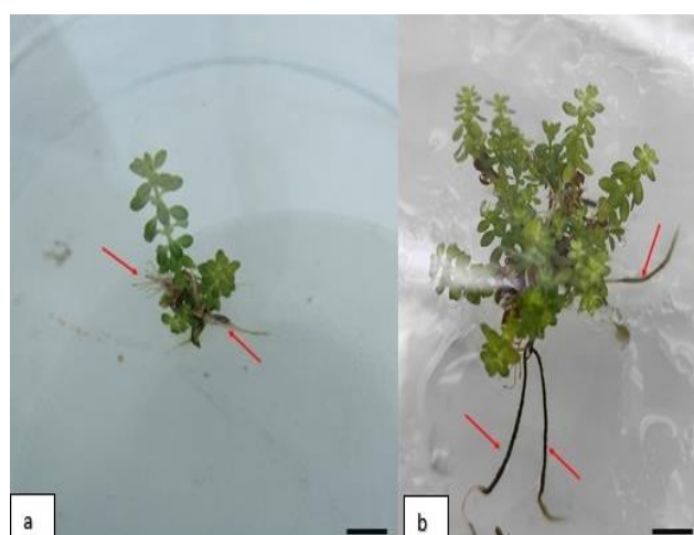
Fig. 3. Root formation in (a) MS + 0.5 mg.L -1 IBA (b) MS + 1.0 mg.L -1 IBA (The dark line/bar below the photos is 1cm, The red arrow shows the root structures formed on the shoots).

Different letters in the columns point out the significant difference ( p < 0.05 )