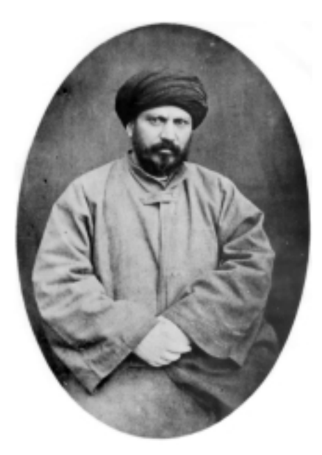
Jamal Muhammad al-Din al-Afghani

to one source, al-Afghani actively sought out Freemasonry because of its political dimension as a liberation movement: