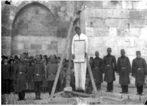
K. Raad, "Traitor hanging at Damascus Gate, Jerusalem 1915.

photography is included. 2 In two other photographic compendiums using Raad's work, those by Walid Khalidi ( Before their Diaspora ) and Elias Sanbar ( Les Palestiniens: la photographie d'une terre et de son peuple ), there are a few references to public protest images, as well as portraits of Turkish military commanders such as Enver Pasha and Jamal Pasha – but these photographs are marginalized by the focus on Raad as a landscape photographer and studio artist. 3