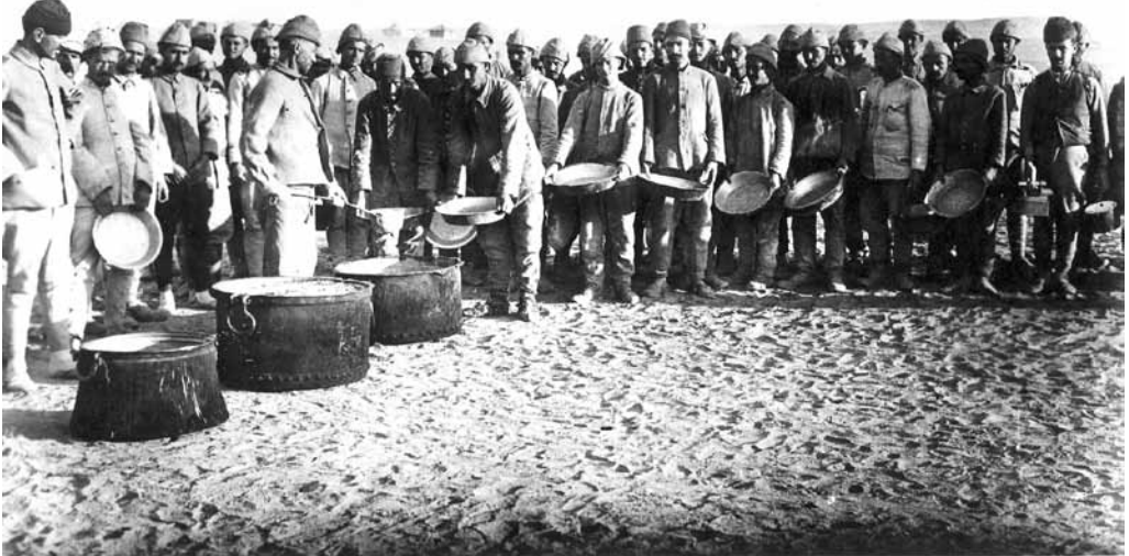
Feeding the Fourth Army, Beersheba.