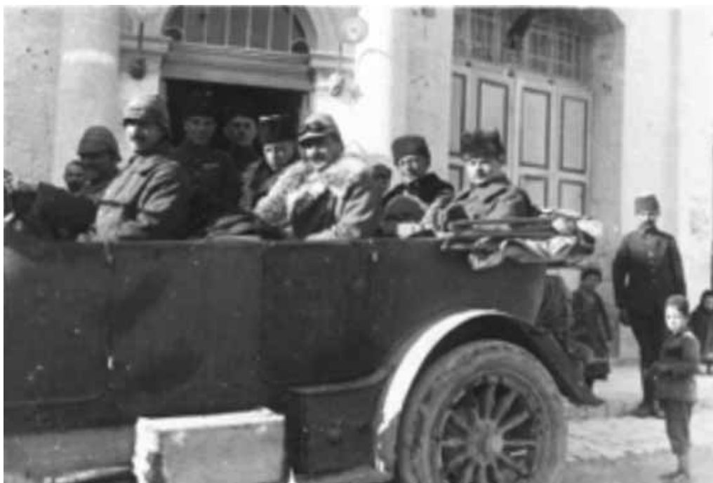
Generals Kress von Kressenstein, Falkenhayn, and Prince Hohenlocke.

the Sultan's birthday at the Manzil , review of troops before going to battle, visits by parliamentary delegates from Istanbul to the front, Jerusalem notables entertaining German officers, and other occasions. 9