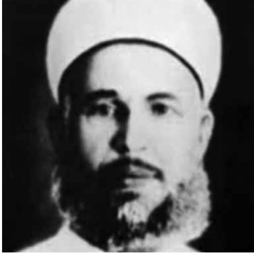
Izz al Din al Qassam by Khalil Raad? Source: Unknown .

was all for publicity purposes, or of propagandistic value alone. At least on two occasions Raad's work reflected astutely on the cruelties of war, and could have been used as damning evidence of Jamal's cruel behavior towards the civilian population. The first image, "Traitor Hanging in Damascus Gate" (R-55) shows the gruesome figure of a hanged man, with a large billboard in Turkish and Arabic announcing his presumed crime ("collaboration with the enemy"). A second image, of the Ottoman Volunteer Labor Brigades ( tawabeer al 'amaleh ) shows a number of old, helpless men doing the back breaking work of carrying rocks by hand to build the southern military road