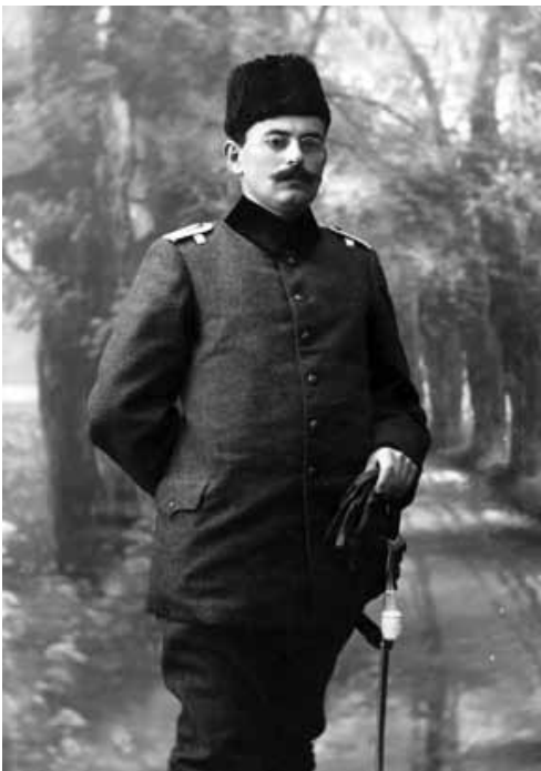
Canaan by Krikorian 1915.

During the war it became customary for local middle class conscripts to have their portraits taken dressed in army uniforms and bearing their guns, swords and other military paraphernalia provided by the studio against an idyllic natural (mostly European) background. For some reason, many of these backdrops were country roads lined with trees, or cutting through woodlands. The figures assumed standard heroic postures in portraits meant as souvenirs for family, fiancées, and friends before the subjects were shipped to the front or other military locations. These portraits were standardized issues, and Raad's were basically similar to those taken by Krikorian, Savides, Sawabinji, and other native studio photographers, many of them Armenians. During the war, however, and possibly because of his direct involvement with the military, Raad began to capture soldiers in more engaged and animated postures that departed from the conventional soldier's portrait. We see this new look in the portrait of the two Khalidi brothers, young Jerusalem