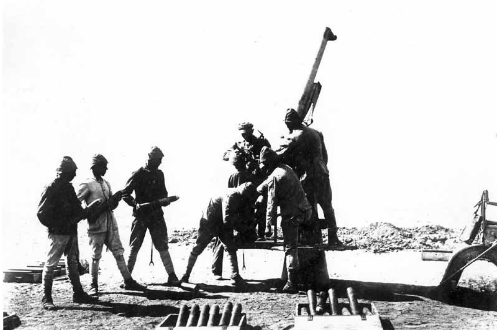
Anti-Aircraft Unit, Beersheba, 1915.