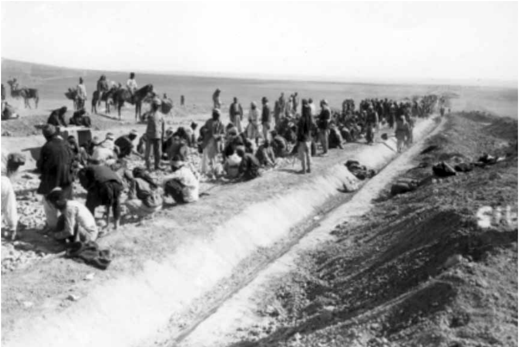
Ottoman 'Volunteer Labour Brigades' building military roads in Beersheba

of Gaza, and Miralai Ali Fuad Pasha, Commander of the 20th Army Corps and the last defender of Jerusalem – and many others, show a degree of intimacy and familiarity with the subjects that contrasts with other formal portraits of officials taken by Raad. 13 This is particularly noticeable in the series taken of Mersinli Jamal Pasha on horseback at the St George compound, and those with his assistant and two children playfully engaged with the photographer. A close-up portrait of Ahmad Jamal, then Minister of the Navy and the fearful dictator of Syria and Palestine, as well as a second portrait of the same Jamal Pasha taking afternoon tea with the children and ladies of the American Colony (attributed to Raad) suggest that our photographer was consciously involved in providing a “human face” to the Ottoman leadership, which was finding itself increasingly alienated from the civilian population.