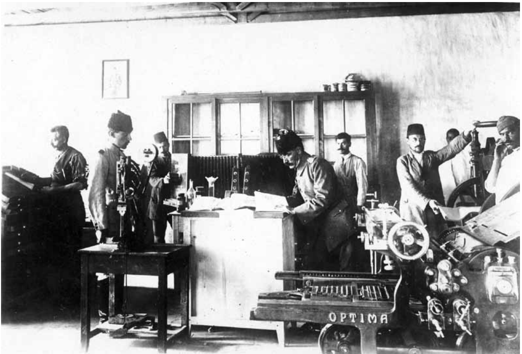
Production of "Juul" (Desert) Newspaper, Underground location, Beersheba, 1915.