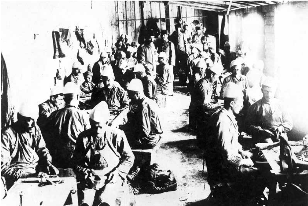
Boot workshop for the Ottoman Soldiers, Jerusalem 1915.