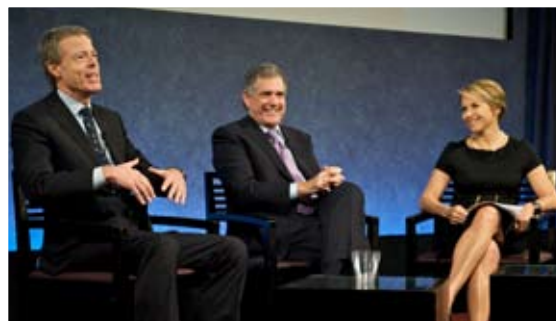
Jeffrey L. Bewkes, Leslie Moonves, and Katie Couric

Katie Couric raised the issue of paying for content—Barry Diller and Rupert Murdoch are declaring it the way to go, she noted, but is it possible the genie is already out of the bottle? Bewkes’s gut response was to mockingly suggest that content, along with food and shelter, should be free. “That is