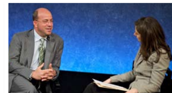
Jeff Zucker and Erin Burnett

“We live in a different world, where everybody is a reporter,” said Zucker, who adds that NBC News must incorporate that reality into the programming it produces without forfeiting credibility.