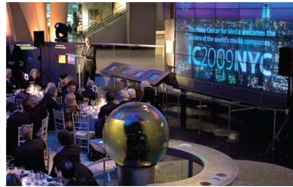
Mayor Michael R. Bloomberg, Gala Dinner at the Rose Center for Earth and Space, The American Museum of Natural History