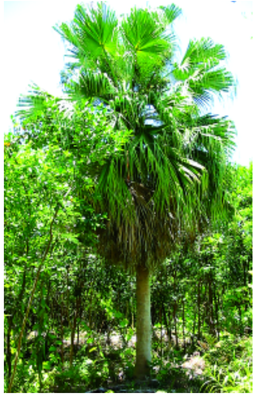
5. Livistona chinensis naturalized in coastal secondary forest of Saint-Philippe, La Réunion, Mascarenes.

However, we predict that more and more species will become naturalized and invasive in French Polynesia and the Mascarenes in the near future, and more generally in tropical islands worldwide as they are becoming very popular landscape and garden plants. The number of introduced species in these islands has dramatically increased in the last decades (Fig. 1). Also, an increase in the number of individuals per species, in the number of localities where they are planted (which together constitute the “propagule pressure” concept) and potential suitable habitat for their establishment and naturalization enhance the risk of invasion. Moreover, several palm species with small fruits ( Ptychosperma macarthurii in Fiji [Watling 2005], Licuala grandis and Dypsis madagascariensis in Tahiti, Washingtonia robusta in La Réunion) are actively dispersed by alien frugivorous birds,