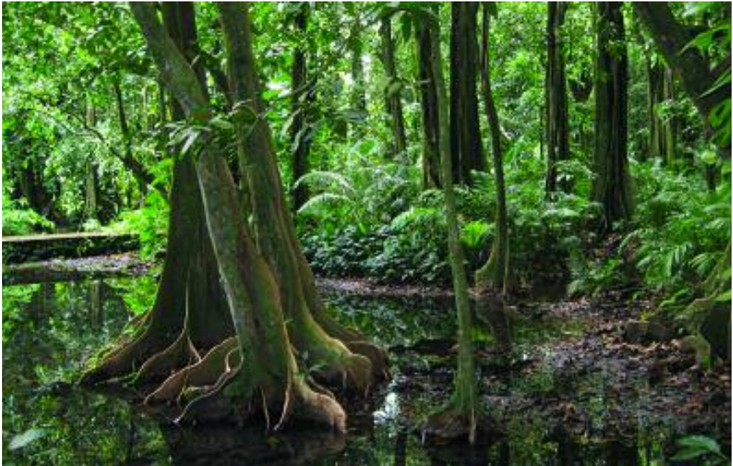
4. Heterospathe elata naturalized in the shaded understory of a Tahitian chestnut Inocarpus fagifer secondary forest in the Jardin Botanique Harrison Smith in the island of Tahiti, French Polynesia.

(Delnatte 2003, Kairo et al. 2003); the MacArthur palm ( P. macarthurii ), native to Queensland and New Guinea and also locally naturalized on the island of Kauai in the Hawaiian Islands (D. Lorence, pers. comm. 2007); Heterospathe elata , from the western Pacific, with many seedlings and young plants growing in the shaded understory of a Tahitian chestnut ( Inocarpus fagifer ) secondary wet forest (Fig. 4); the Taraw palm ( Livistona saribus ), native to Southeast-Asia, which is also well-established in Panama (Svenning 2006); and the Australian cabbage palm ( L. australis ) and Oncosperma tigillarum (Hodel 1982).