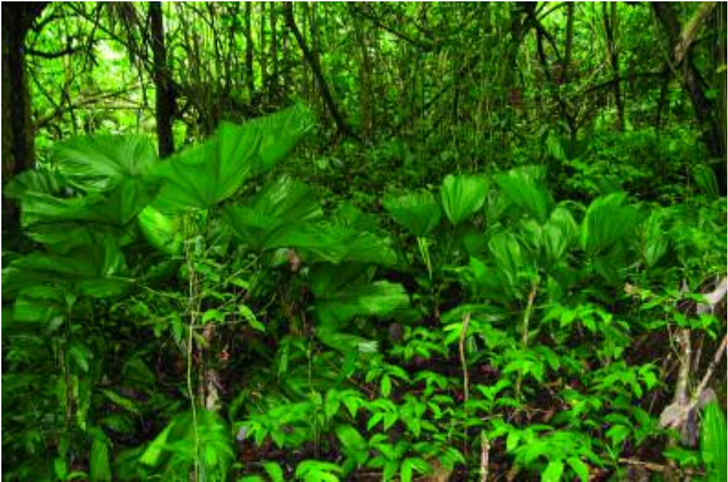
2. Seedlings of Licuala grandis in the understory of lowland rainforest on the island of Tahaa, French Polynesia.

The Sagisi palm ( Heterospatha elata ), which was introduced to Guam between 1900 and 1920, is spreading in ravines and slopes (Jones 1995, Space & Falanruw 1999).