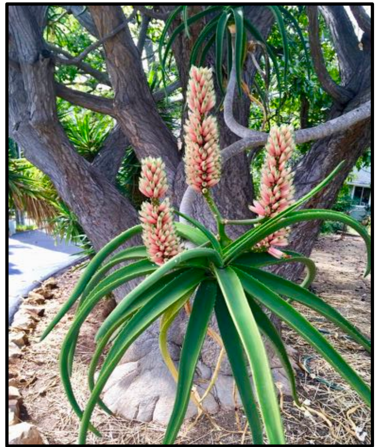
Above: Ron Chisum's 8' diameter Aloe barberae (bainesii) with huge bloom stalks!

Share a section of your garden, a plant that bloomed in between meetings, or one that is too large or heavy to bring to the Brag Table. You will earn 1 brag plant point for emailing or texting photo(s), and 2 points for each one printed. Email with your name and plant names, to Annie at <u>info@palomarcactus.org.</u>