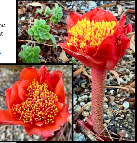
Susan LaFreniere's Haemanthus coccineus bulb in bloom – from September