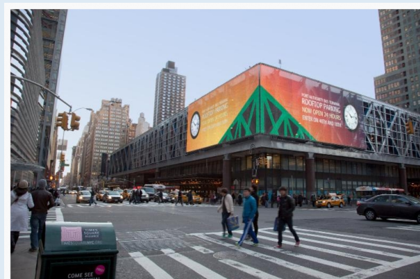
View of Port Authority Bus Terminal at the Corner of 8th Avenue and 42nd Street

"The Port Authority Board of Commissioners at its meeting on July 23 authorized $90 million to a "Quality of Commute" improvement program for the Port Authority Bus Terminal. The functionally obsolete facility no longer meets the transportation needs of the hundreds of thousands of riders that pass through the terminal every day, and the Port Authority is committed to identifying comprehensive improvements within the context of its existing Capital Plan. This initiative will make interim improvements to the terminal as the agency explores a program to deliver a redeveloped facility."