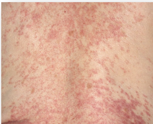
Fig. 2 Erythematous (reddish) macules (spots) on the back

While blisters only appear on some parts of the body in some patients, in others, the whole body is affected. Apart from intensive itching, general health is not affected in most patients. However, loss of appetite, body weight, fever, infections, and general weakness can develop during the course of the disease.