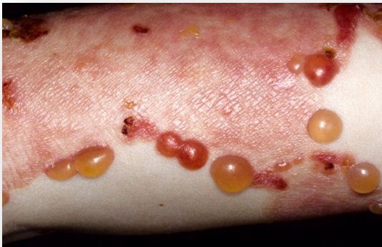
Fig. 1 Clear and haemorrhagic (bloody) tense blisters, crusts and erythema (red skin) on the arm

Patients almost always suffer from severe itching accompanied by tense (taut or stretched) blisters on red or otherwise normal skin ( Fig. 1 ). Itching may start weeks or even months before the first skin manifestations arise. The blisters contain a clear or bloody fluid, and develop further into erosions (skin breakdown) and crusts (scabs) when damaged, but they normally heal without scarring. In about one-fifth of patients, erosions may develop in the mouth or on the genitalia.