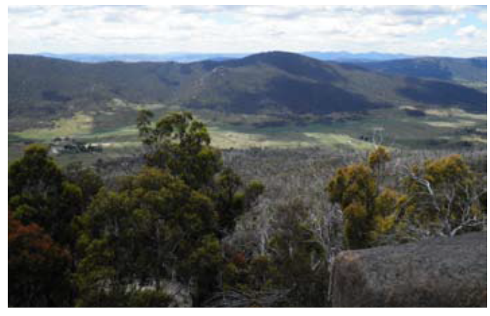
Orroral Valley (above) and granite boulders (below) from the end of the track.

The Granite Tors track starts from the Cotter Hut Road/Orroral management trail, initially passing through Snow Gum, Black Sallee, tea tree and Snowgrass. As you climb, the forest changes to Ribbon Gum, Mountain Gum, Candle Bark and Broad-leaved Peppermint.