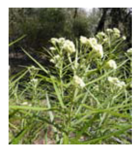
Alpine Rice Flower (above left) Fringe Lily (above right), Dogwood (left)

At the lookout, stay behind the barrier as there is a steep drop beyond.