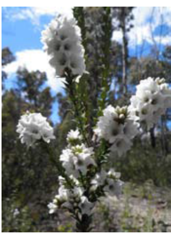
Austral Bugle (left) and Drumstick Heath (right)