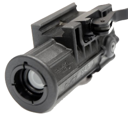
CAMERA 12 mm

Detachable quick-connecting color video camera 12 mm lens LLTV-Night Vision capabilities for 20 meter ( with the IR filter) CMC1N12