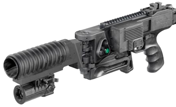
CS 40/37 (M203)