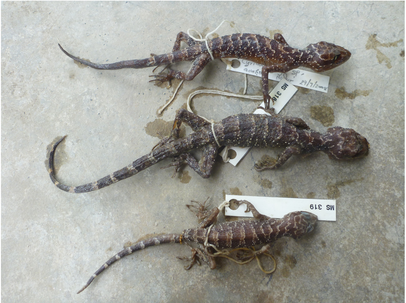
FIGURE 2. Preserved type series of Cyrtodactylus doisuthep sp. nov. in dorsal view.

Scales on palm and sole smooth, rounded to oval or hexagonal, slightly domed. Scalation on dorsal surface of hind and forelimbs similar to body dorsum with enlarged conical tubercles interspersed among smaller scales. Fore and hind limbs relatively long, slender (Foreal/SVL ratio 0.16, Tibial/SVL 0.19). Digits long, slender, inflected at interphalangeal joints, all bearing robust, slightly recurved claws. Basal subdigital lamellae broad, oval to rectangular, without scansorial surfaces (5-5-6-6-8 right manus, 5-6-7-8-7 right pes); narrow lamellae distal to digital inflection and not including ventral claw sheath: 10-11-12-13-11 (right manus), 10-11-12-11-13 (right pes); no interdigital webbing. Relative lengths of digits: III>IV>II>V>I (manus), V>III>IV>II>I (pes). Partly regenerated tail, gently tapering to pointed tip, slightly shorter than SVL (TailL/SVL ratio 0.95). Original and regenerated parts of tail with enlarged median subcaudal scales.