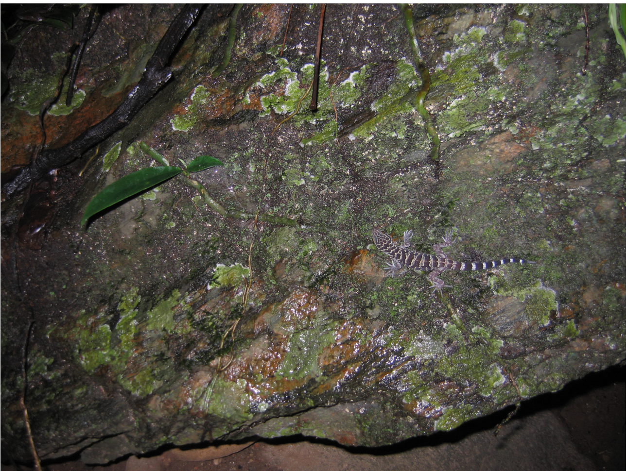
FIGURE 4. Microhabitat of Cyrtodactylus doisuthep sp. nov. (also showing the paratype QSMI 1168) at type locality on Doi Suthep, Chiang Mai Province.

Among all the species showing precloacal pores but lacking femoral pores, the one showing the closest — although distinct — dorsal pattern to that of Cyrtodactylus doisuthep sp. nov. is C. thochuensis , a species whose descriptors stated that it morphologically most closely resembles C. condorensis and C. paradoxus (Ngo & Grismer 2012). And among all Thai and Indochinese species, possessing femoral pores or not, the one showing the most similar dorsal pattern to Cyrtodactylus doisuthep sp. nov. is the Southern Vietnamese C. kingsadai . It is itself, according to its descriptors (Ziegler et al. 2013), phylogenetically allied to C. bugiamapensis , C. caovansungi , C. consobrinus , C. paradoxus , C. pubisulcus Inger, C. quadrivirgatus and C. ziegleri . Some of these latter species ( C. bugiamapensis , C. condorensis , C. paradoxus , C. pubisulcus , C. quadrivirgatus and C. thochuensis ) show precloacal pores but lack femoral pores similarly to Cyrtodactylus doisuthep sp. nov. , but four ( C. caovansungi , C. consobrinus , C. kingsadai and C. ziegleri ) show femoral and precloacal pores separated by a diastema.