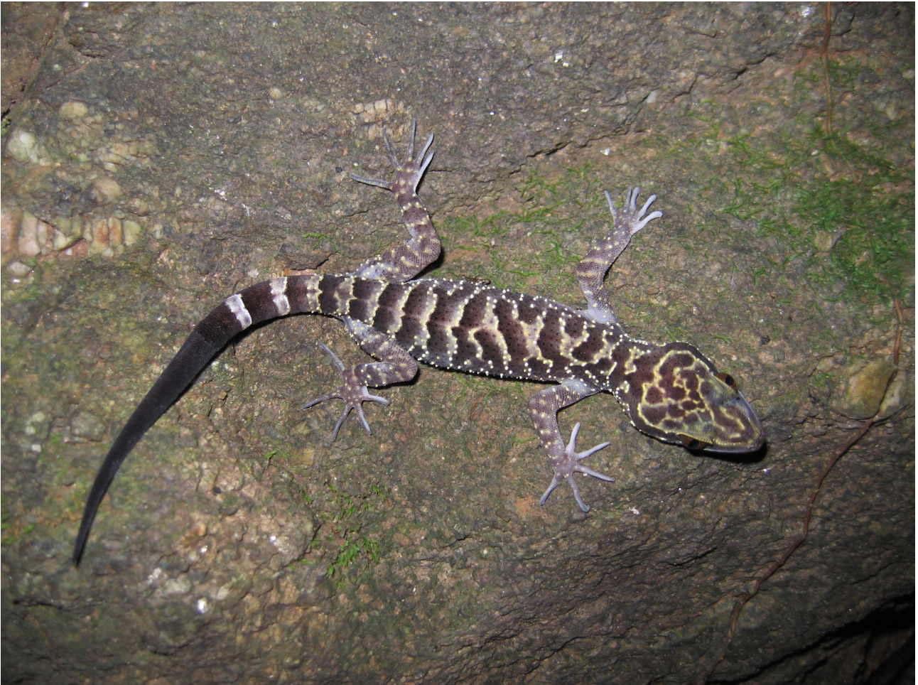
FIGURE 1. Live adult male holotype of Cyrtodactylus doisuthep sp. nov. at type locality on Doi Suthep, Chiang Mai Province.

crease very short (about a quarter of rostral height). Two enlarged supranasals in broad contact with one another, no internasals. Rostral in contact with first supralabials, nostrils, and supranasals. Nostrils oval, more or less laterally directed, each surrounded by supranasal, rostral, first supralabial and two enlarged postnasals. Three or four rows of small scales separate orbit from supralabials. Mental triangular, wider (3.7 mm) than deep (2.3 mm). A single pair of greatly enlarged postmentals in broad contact behind mental, each bordered anteromedially by mental, anterolaterally by first infralabial, posterolaterally by an enlarged lateral chinshield, and posteriorly by three granules. Supralabials to mid-orbital position 8/8, enlarged supralabials to angle of jaws 10/11. Infralabials 10/8. Interorbital scale rows across narrowest point of frontal bone 24.