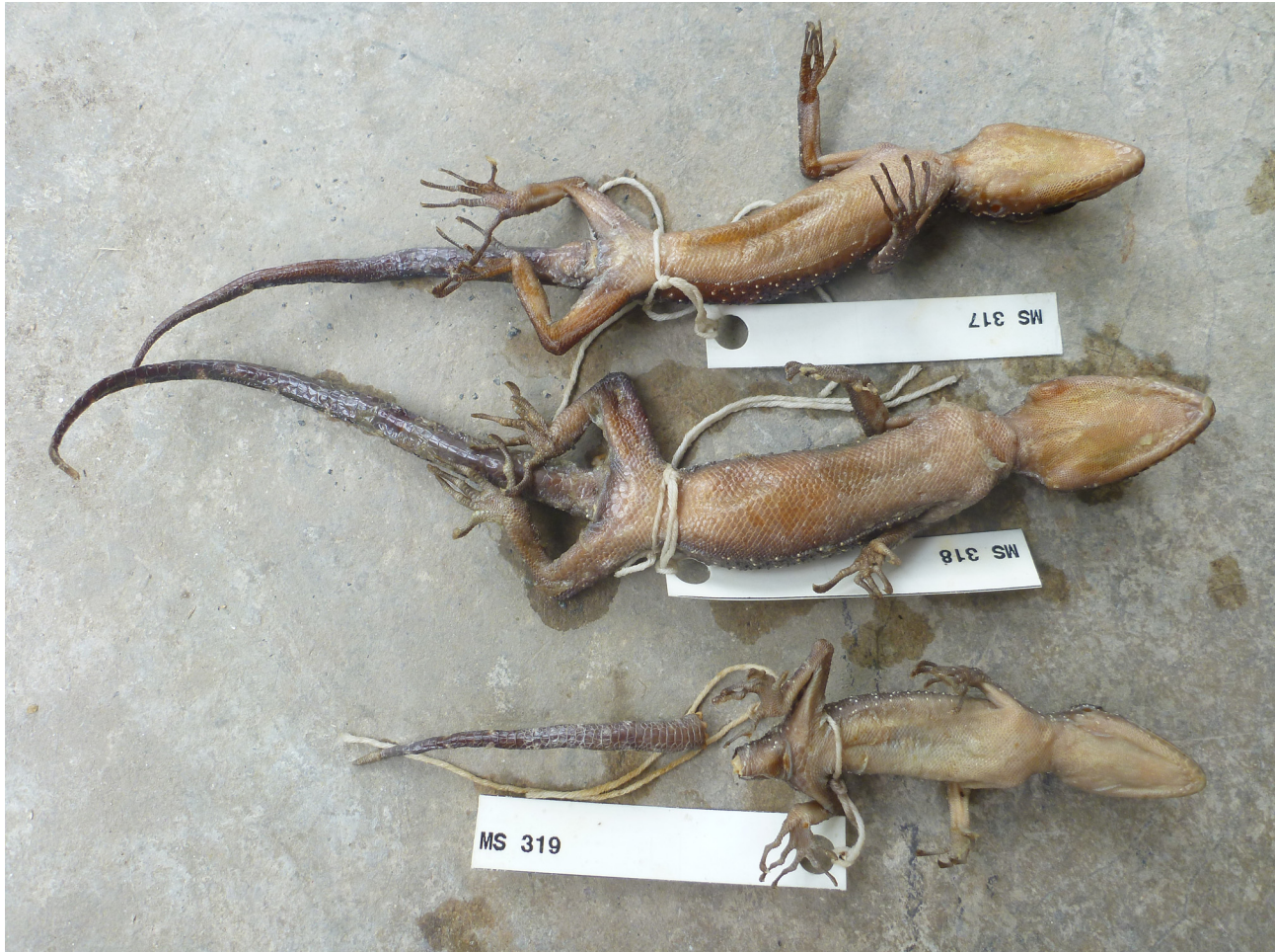
FIGURE 3. Preserved type series of Cyrtodactylus doisuthep sp. nov. in ventral view.

unpitted poreless scales + six pitted preanal scales + a diastema of seven unpitted poreless scales + six pitted femoral scales + two unpitted poreless scales. QSMI 1168 shows a continuous series of 35 enlarged femoro-precloacal scales, as follows, from left to right: two unpitted poreless scales + six pitted femoral scales + a diastema of six unpitted poreless scales + six pitted preanal scales + a diastema of six unpitted poreless scales + seven pitted femoral scales + one unpitted poreless scale. Postcloacal spurs in CUMZ-R-0.2318 like in holotype. Tail of CUMZ-R-0.2318 original, longer than body (TailL/SVL ratio 1.19), with 10 light dorsal rings not encircling the tail.