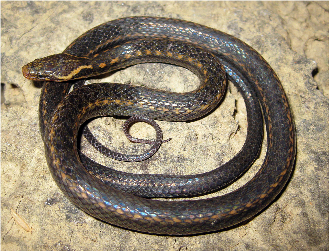
FIGURE 4. Parahelicops annamensis, (IEBR A.2013.16; male) alive, Phong Nha - Ke Bang National Park, Hoa Son Commune, Minh Hoa District, Quang Binh Province, Vietnam.