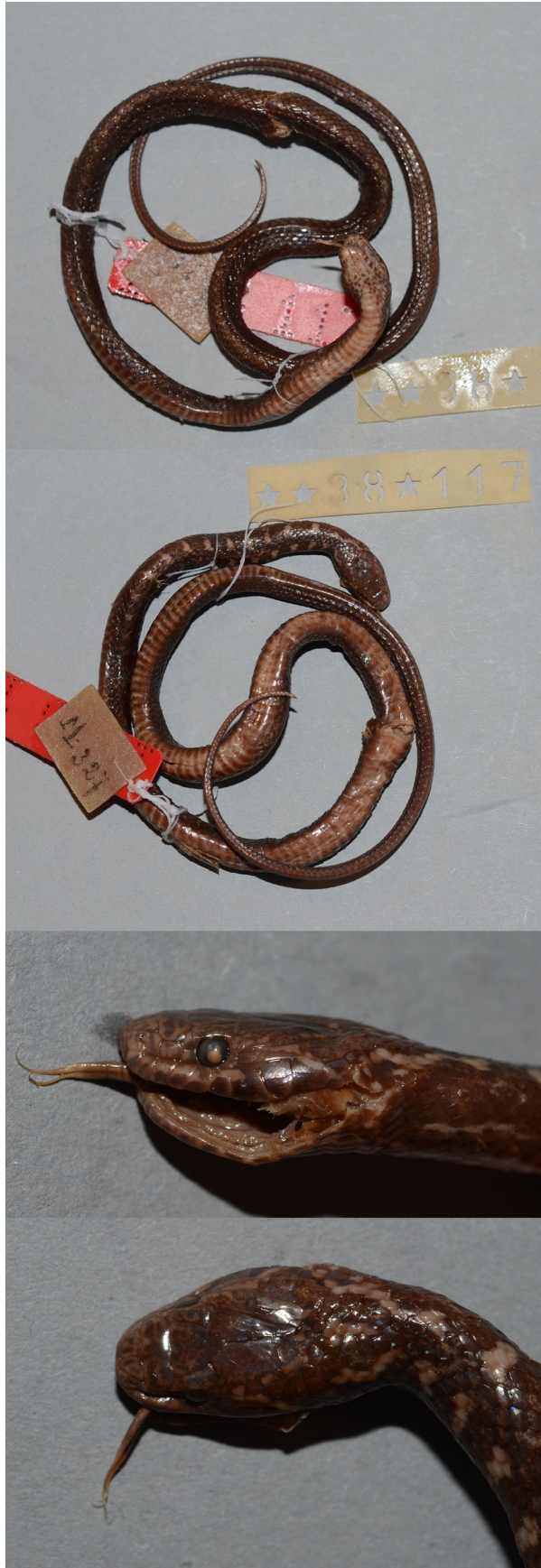
FIGURE 3. Parahelicops annamensis, preserved holotype (MNHN 1938.0117). From top to bottom: Dorsal view - Ventral view - Lateral view of the head and neck, left side - Dorsal view of head.