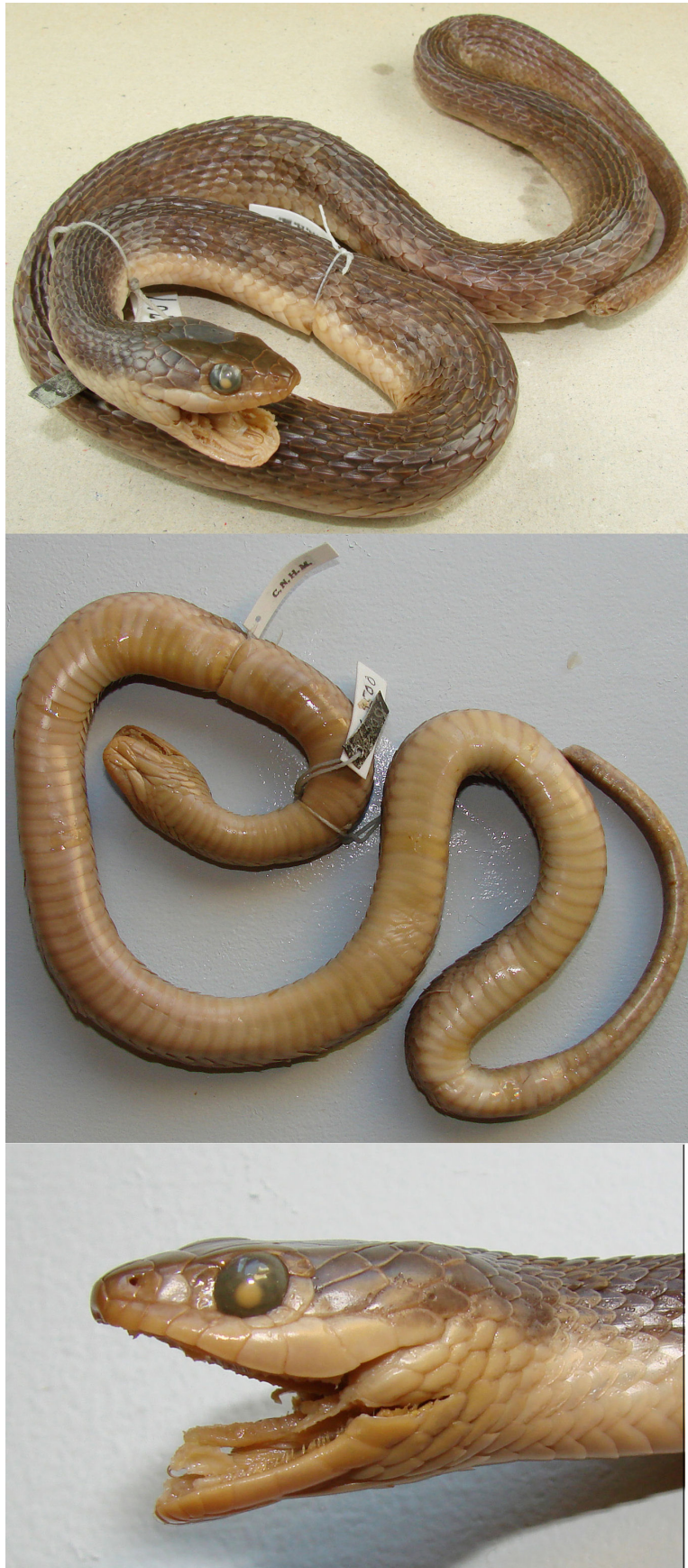
FIGURE 1. Isanophis boonsongi new comb., preserved holotype (FMNH 135328). From top to bottom: Dorsal view - Ventral view - Lateral view of the head and neck, left side.